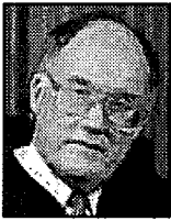
Chief Justice William H. Rehnquist

Three times we have confronted establishment clause challenges to neutral government programs that provide aid directly to a broad class of individuals, who, in turn, direct the aid to religious schools or institutions of their own choosing . Three times we have rejected such challenges.