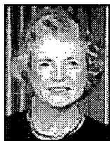
Justice Sandra Day O'Connor

While I join the court's opinion, I write separately for two reasons. First, although the court takes an important step, I do not believe that today's decision, when considered in light of other long-standing government programs that impact religious organizations and our prior establishment clause jurisprudence, marks a dramatic break from the past. Second, given the emphasis the court places on verifying that parents of voucher students in religious schools have exercised true private choice, I think it is worth elaborating on the court's conclusion that this inquiry should consider all reasonable educational alternatives to religious schools that are available to parents. To do otherwise is to ignore how the educational system in Cleveland actually functions.