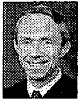
Justice David H. Souter

The court's majority holds that the establishment clause is no bar to Ohio's payment of tuition at private religious elementary and middle schools under a scheme that systematically provides tax money to support the schools' religious missions. The occasion for the legislation thus upheld is the condition of public education in the city of Cleveland. The record indicates that the schools are failing to serve their objective, and the vouchers in issue here are said to be needed to provide adequate alternatives to them. If there were an excuse for giving short shrift to the establishment clause, it would probably apply here. But there is no excuse. Constitutional limitations are placed on government to preserve constitutional values in hard cases, like these.