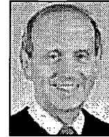
Justice Stephen G. Breyer

make no law respecting an establishment of religion, and a guarantee, that the government shall not prohibit the free exercise thereof. These clauses embody an understanding, reached in the 17th century after decades of religious war, that liberty and social stability demand a religious tolerance that respects the religious views of all citizens, permits those citizens to worship God in their own way, and allows all families to teach their children and to form their characters as they wish. The clauses reflect the Framers' vision of an American nation free of the religious strife that had long plagued the nations of Europe.