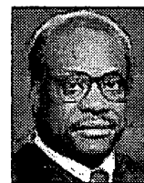
Justice Clarence Thomas

The establishment clause of the First Amendment states that "Congress shall make no law respecting an establishment of religion." On its face, this provision places no limit on the states with regard to religion. The establishment clause originally protected states, and by extension their citizens, from the imposition of an established religion by the federal government.