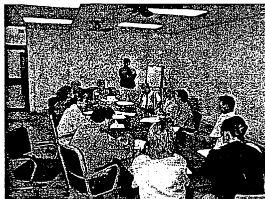
Fig.1. CITC meeting, Tulia, Texas June 2000, Swisher County (Tulia, County Seat)

Texas Tech University in collaboration with Swisher County of Texas and the county seat of Tulia is piloting a community access center by developing a Collaborative Information Technology Center (CITC). With this pilot we will assess the feasibility of developing satellite CITCs in West Texas that will directly connect to a major Collaborative Information Technology Center in Lubbock, Texas, under the auspices of Texas Tech University. CITCs have the potential of serving some rural communities and bridging the "digital divide," both a concern of state and federal agencies.