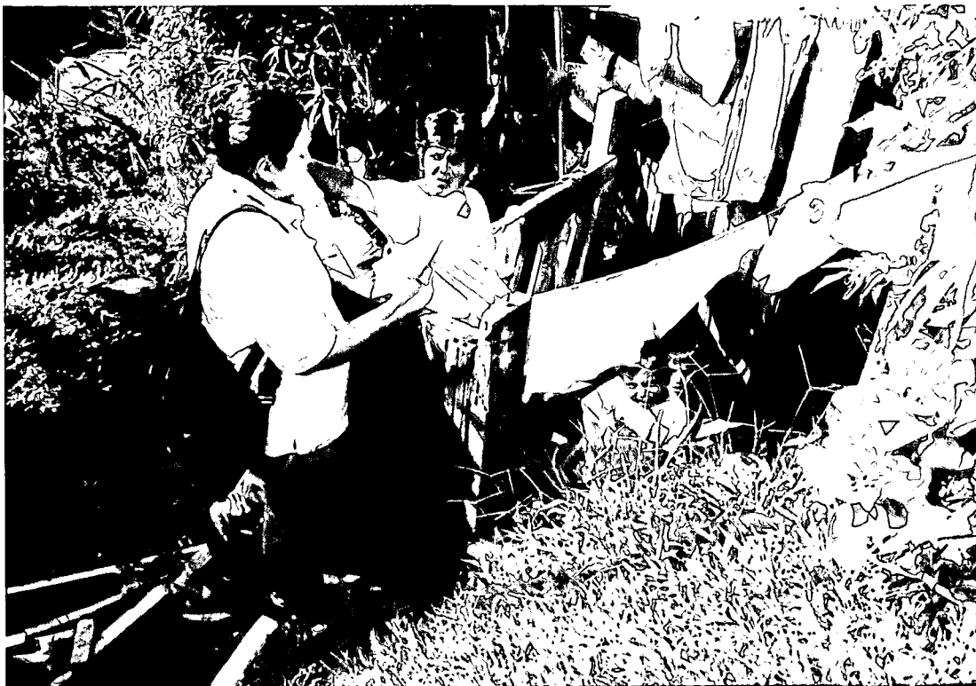
Caldas, Colombia: Visiting rural families

project: Infancia y Familia Rural ; Fundación para el Desarrollo Integral del Menor y la Familia (FESCO)