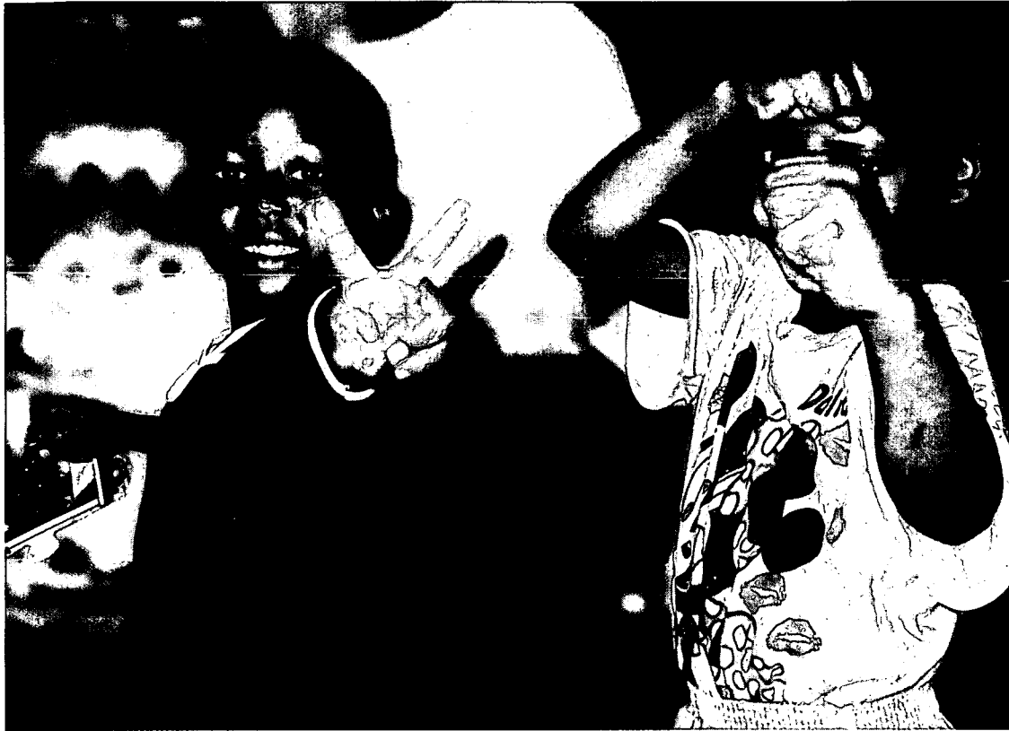
South Africa: Enthusiasm at the Community ECD Centre project: Rethinking Educare; Association for Training and Resources in Early Education (TREE)