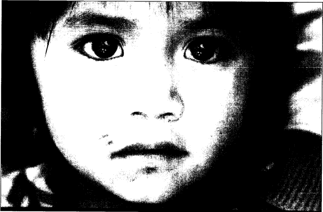
Mexico: Girl of the Otomíe Community in Mexico City project: Centro Interdisciplinario para el Desarrollo Social (CIDES)