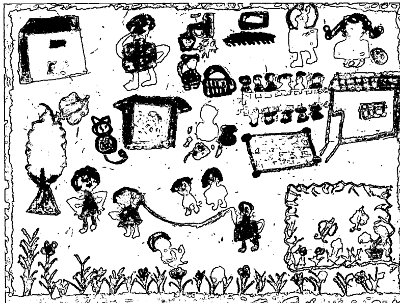
New Delhi, India: Drawing by Neelu, 8 years project: Who cares for children? Mobile Crèches

Thematic Programmes explore one specific topic – for example, Children Affected by HIV/AIDS; Respect for Diversity; or Growing up in Indigenous Societies. Themes do not relate to national contexts but to key areas of interests across borders. This means that Thematic Programmes may occasionally include countries that are not otherwise eligible for funding. Within these programmes, the Foundation invests in activities that will inform its understandings and highlight key programmatic experiences.