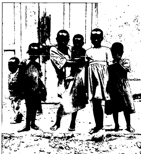
Busia District, Kenya: Fatherless children taking care of each other while their mothers attend a meeting on needs analysis project: Kenya Orphans and Rural Development Programme

For promoting the well-being of young children in Samburu District through interventions in health, nutrition, education and early stimulation. This will be based on participatory methodologies to identify the community's needs in planning and implementation. The project will build on the traditional childcare enclosures called loipi. These are enclosures located near the homesteads, where children play and rest while their parents are away. Grandparents and parents watch over and monitor the activities of the children, passing on Samburu values through story telling, songs and games, something that is under pressure due to factors such as poverty, insecurity, and ongoing conflict between modern and traditional lifestyles. The project will add modern approaches to education and to health – including health education for the parents, regular growth monitoring, immunisation, and supplementary