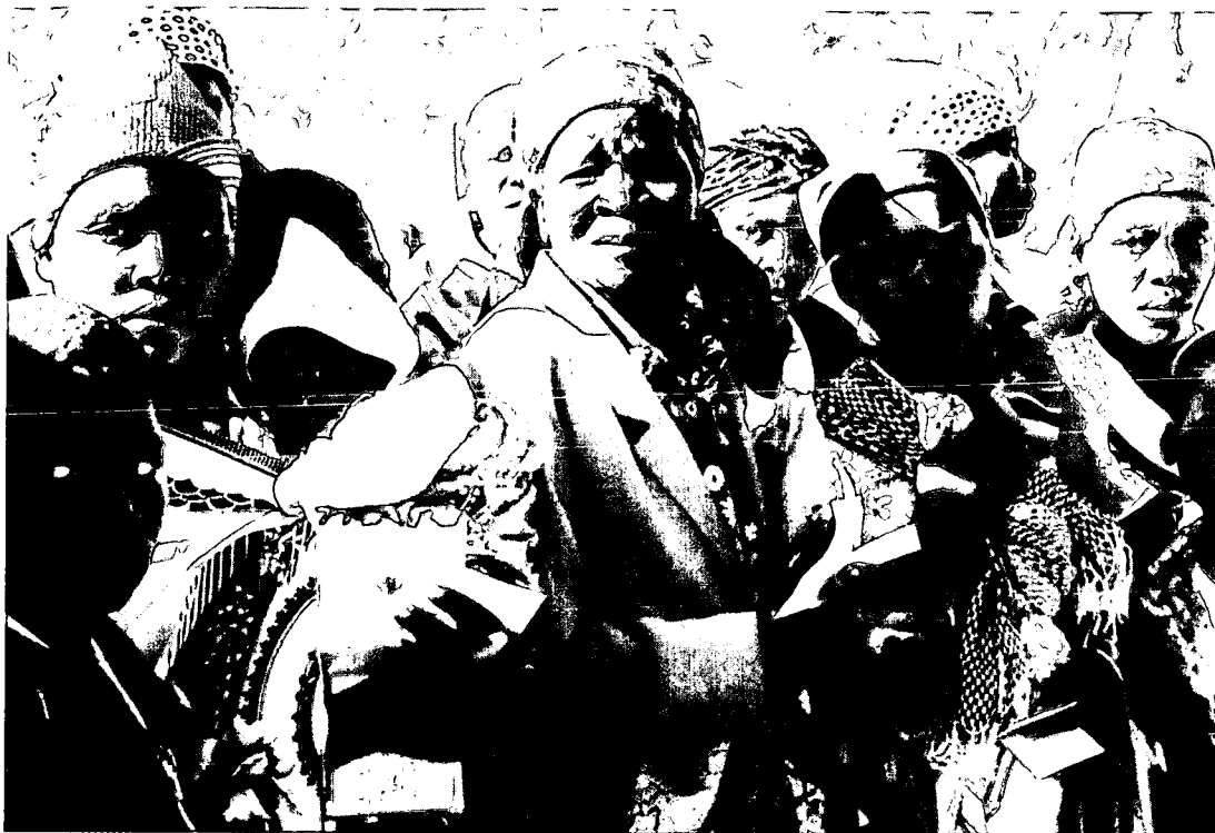
Mozambique: Child rights – mothers and children stand in line to be registered