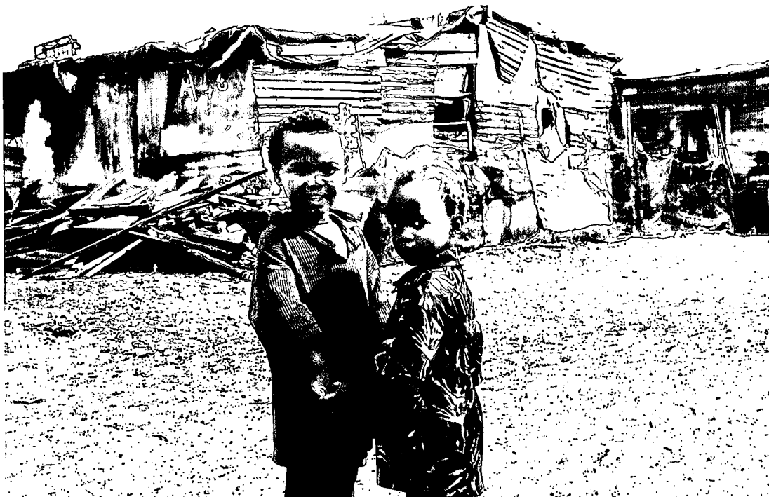
Cape Province, South Africa: Two boys who benefit from the activities of the Family in Focus project in the Witsands informal settlement project: Family in Focus (FIF)