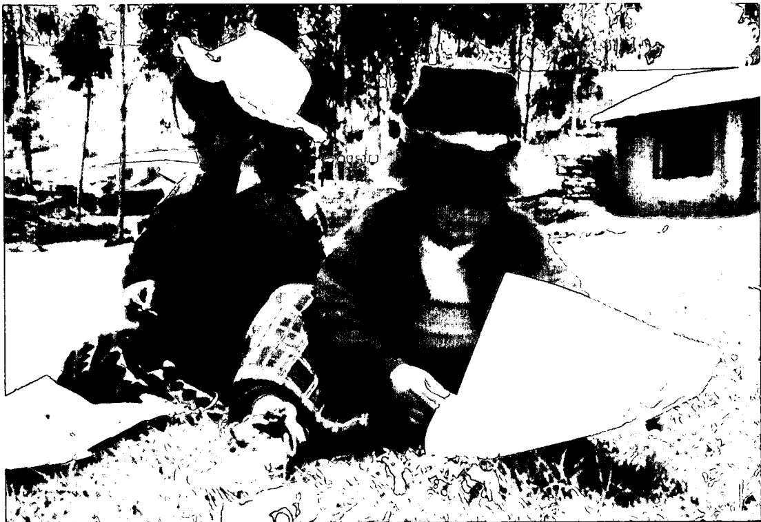
Peru: Girls from Huancavelica making a collage to stimulate creativity and fine motor development project: Instituto para la Investigación y el Desarrollo Económico y Social (INIDES)

among rural Quechua-speaking families. The project is an exercise in joint implementation involving three statutory stakeholders: PROMUDEH; MINEDUC; and INABIF. Topics to be explored include male caring, fostering, nurturing and teaching of children, as well as the relationship between fathers and their children. The project will analyse the effectiveness of a multi-sectoral endeavour, helping to increase the impact of the field activities and reduce operational costs.