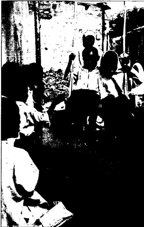
Zanzibar, Tanzania: Enjoying a swing project: Madrasa Preschool Programme; Madrasa Resource Centre

following principles to make the most effective use of the available resources: