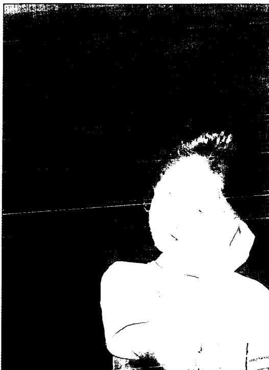
Netherlands: Young children's views project: Listening to young children; Wetenschappelijk Educatieve en Sociaal-Kulturele Projecten (WESP)