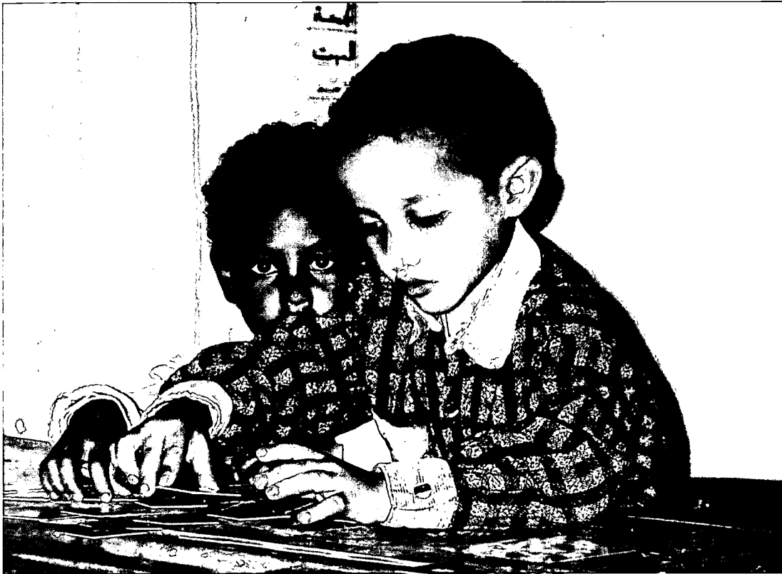
Errachidia, Morocco: Boys at preschool

Of course, such similarities fade as children get older and are more and more shaped by their different cultures. But the well-being of small children is a common ground and the barriers for understanding are probably lower than in most other matters. We should build on this, making early childhood a platform where international cooperation and exchange is much more intense and visible.