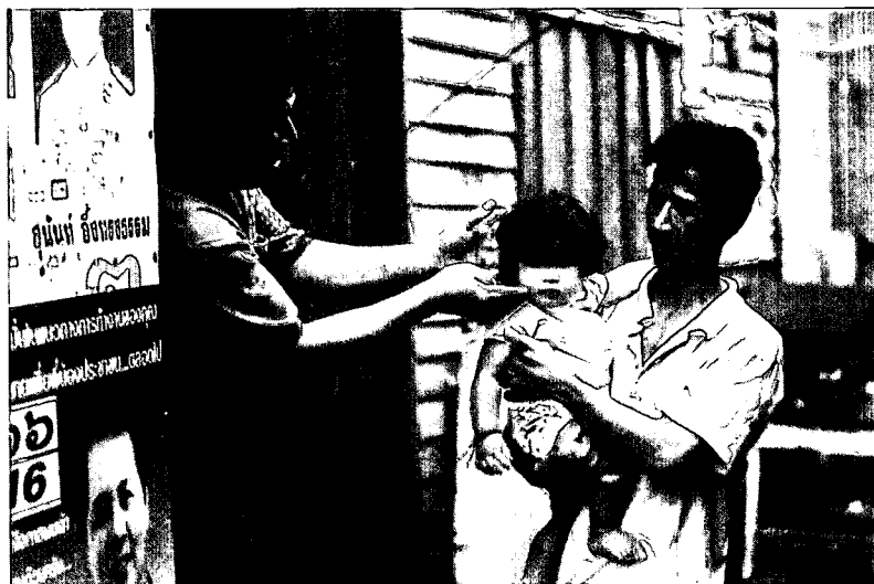
Bangkok, Thailand: Nong, 36, and Tung nine months project: My Babies Second Home; Foundation for Slum Child Care (fsccl)

The total spending by the Foundation in 2001 amounted to EUR 19.3 million, of which more than 90% came from the Van Leer Group Foundation. The following co-funders channeled a total of EUR 369,800 through the Foundation to support work with young children: Verhagen Foundation (Netherlands); Fonds 1818 (Netherlands); Stichting Klein Hofwijck (Netherlands); The Franciscus O Fund (Belgium) managed by the King Baudouin Foundation; and the Rich Foundation (Israel).