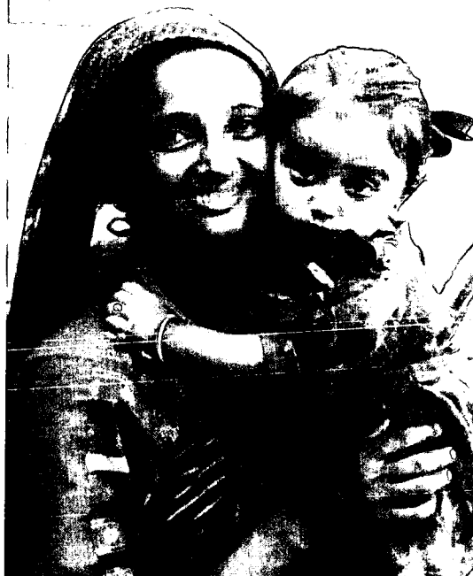
Gujarat, India: A mother and children helped in rebuilding and rehabilitation after the 2001 earthquake by VHAI teams project: Earthquake Relief, Voluntary Health Association of India (VHAI)

For a programme of work to strengthen the TN-FORCES network for child survival and development that operates in Tamil Nadu State. TN-FORCES is part of the FORCES national network (see entry below). It has gathered 105 members – comprised of NGOs, public