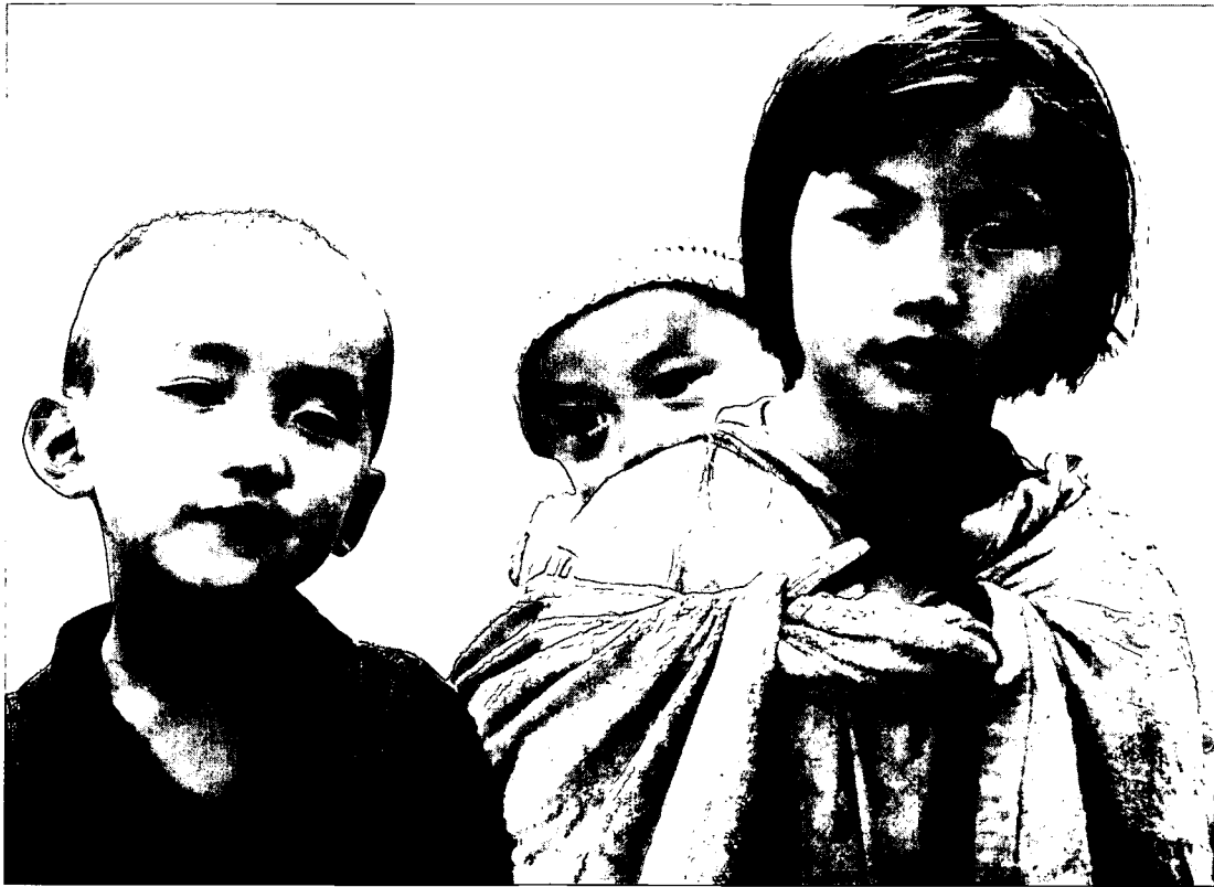
Thailand: Hmong children taking care of younger siblings project: Footholds in the Hills; Inter Mountain Peoples Education and Culture in Thailand Association (IMPECT)

teachers and community leaders in child development, leadership and cultural knowledge will be strengthened. Multi-media learning materials will be produced for children and parents. In addition, two workshops with academics, NGOs, government agencies and social groups will develop common strategies in supporting tribal children.