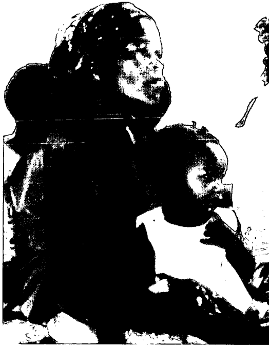
Mozambique: A grandmother listening to questions about transmission and symptoms of HIV/AIDS project: A New Path for Children; Associação da Criança, Família y Desenvolvimento (CFD)

with HIV/AIDS. One strength of such programmes is that they can provide substantial support to some of those hardest hit by the epidemic: households headed by children. For instance, they can offer older children counselling to help them cope with their grief; informal education if their family responsibilities have caused them to leave school; respite from caregiving by creating opportunities for younger siblings to attend daycare centres; and opportunities to increase their income. In such situations, it is worth stressing the Foundation's commitment to listening to children's voices: it is important to learn how children experience their vulnerability as this bears witness to their plight, and helps us and our partners develop more effective responses.