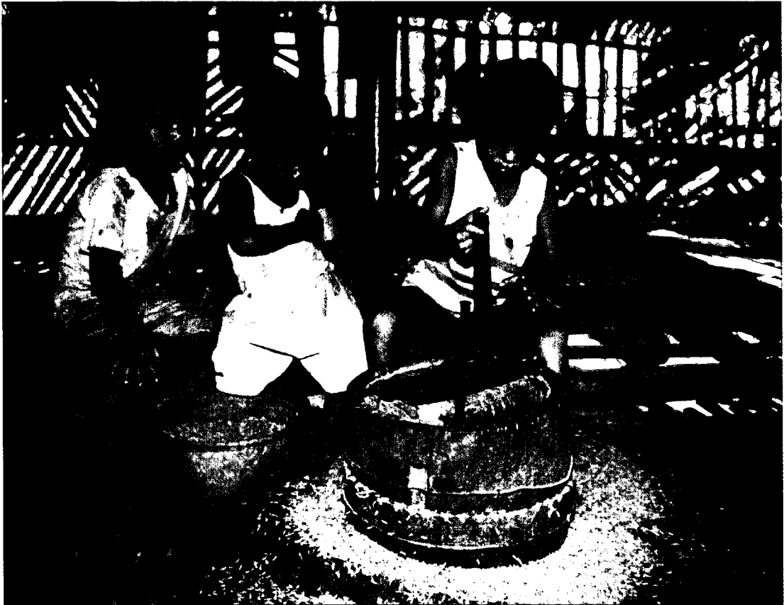
Malaysia: Threshing padi

project: Lessons from the Countryside; Partners of Community Organisations in Sabah (PACOS)