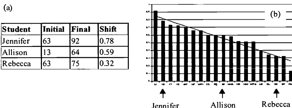
Table 1: (a) Initial and final test scores for the 3 students. (b) Distribution of the shift statistic for the whole class. Note that shift scales linearly with rank: r^2 = 0.93

We interpret shift as how much students have moved from their initial test result to their final test result. A student who has a relatively high initial test score does not have as much room for improvement as a student with a low initial test score. However, since the shift statistic takes into account a student's potential for growth , it is possible that any student can attain the highest shift, 1.00. The other two students—Allison and Rebecca—we use to compare with Jennifer were chosen to be representative of students with a middle and low shift value, respectively.