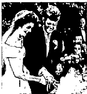
September 12, 1953. Jacqueline Bouvier Kennedy and John F. Kennedy at their wedding reception at Hammersmith Farm.

Jackie came back from her European vacation and started her first job in the Fall of 1951 as the 'Inquiring Camera Girl' for the Washington Times-Herald newspaper. Her job was to go around the city of Washington asking citizens questions on the issues of the day, which she would later write up in her newspaper column.