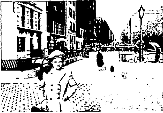
Jackie at Miss Chapin's School in New York City.