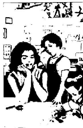
Mrs. Kennedy and Caroline with classmate in the White House school, May 24, 1963