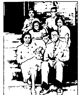
Jackie (top left) and family