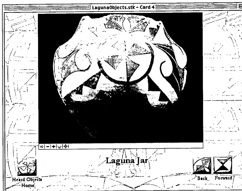
Figure 2: The Heard Virtual Museum CD-ROM

The Heard Museum in Phoenix, Arizona, is another Four Directions museum partner that has been involved in virtual museum projects with three other schools. In May, 2000, students and teachers from Dilcon Boarding School (Navajo, Arizona), Seba Dalkai School (Navajo, Arizona), and Laguna Elementary School (Pueblo, New Mexico) spent four days at the museum, documenting items for the purpose of illustrating virtual museum projects in their communities. Dilcon Boarding School and Seba Dalkai School combined the media that students created at the Heard with oral histories, QTVR panoramas and photographs created locally to make a virtual museum of the schools histories. Laguna Elementary School will use the media its students created for a virtual tour of the Pueblo of Laguna community. Teachers and project partners used HyperStudio to author the virtual museums, which were distributed to the Heard Museum and the three schools on CD-ROM. The Heard Museum plans to use the CD-ROM as part of an exhibition on American Indian boarding schools.