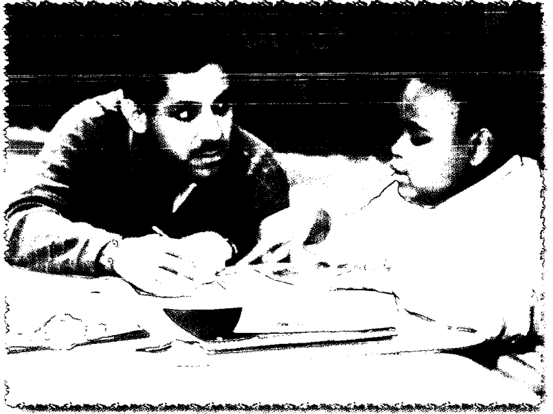
Helping youth explore opportunities and options is a key component of the Carrera model.

For Lydia, an 11-year-old student at Mirabal,