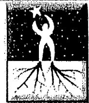
Rooted in Character