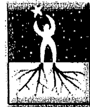
Rooted in Character

Citizenship education examines the conduct of the individual as part of a democratic society. External behaviors of "good citizenship" are identified through participation in the larger society with those behaviors contributing to the "common good". Citizenship education begins at an early age as we emphasize the rules of good social behavior as well as benefits to be gained from those actions. In school, citizenship education is developed through classroom participation, elections, decision-making opportunities, social action to benefit the community and similar opportunities for students to feel a part of the larger community and that their contributions are valued. Good citizenship opportunities in the school can translate into greater community involvement as an adult with greater voter turnout, service on juries, and involvement in community endeavors for improvement.