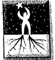
Rooted in Character

Moral education deals with the philosophical underpinnings of our individual motivations. Philosophers have long been concerned with the development of individual values and actions in the social community. Moral education is taught and practiced in the home and religious institutions, yet also carries over into the educational community which decides what is of value to the society and should be taught in the schools. Moral education focuses more on understandings and beliefs as a basis for understanding behaviors.