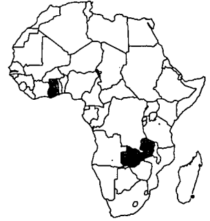
Countries involved in this activity: Ghana, Zambia