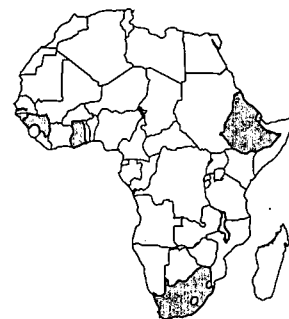
Countries involved in this activity: Ethiopia, Ghana, Guinea, Malawi, South Africa