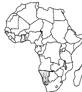
Countries involved in this activity: Ghana, Malawi, Namibia