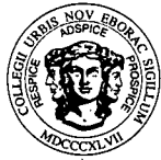
City University of New York, City College