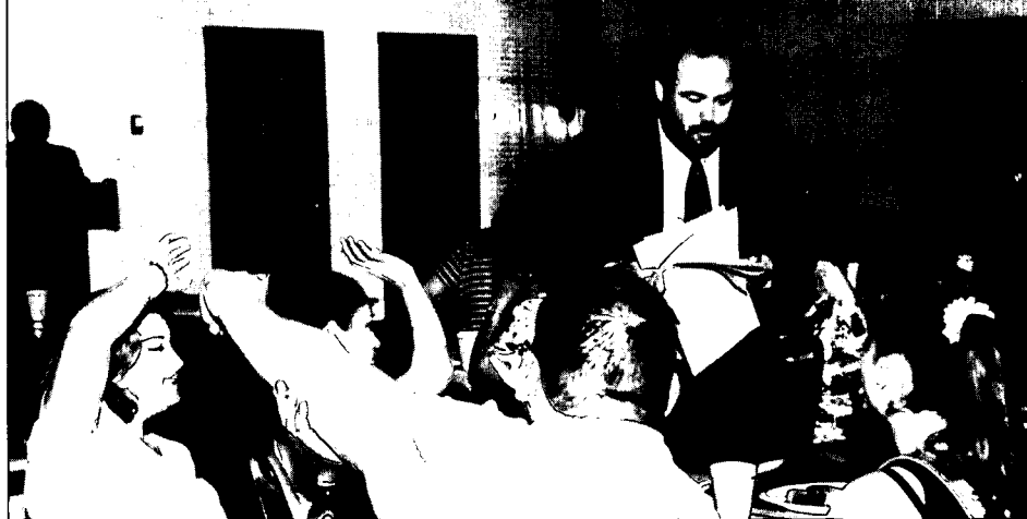
Students in Fabens, Texas, are active participants in the school district's Collaborative Action Team (CAT). The CAT process is one that helps build leadership capacity in the district, drawing parents, students, teachers, and community members into the decisionmaking process.