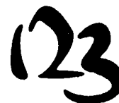
And Logic smart