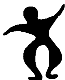
Body smart and