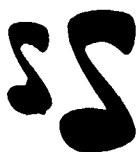
Music smart and