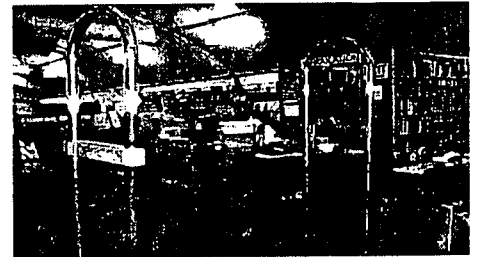
Above & Below: Views of the library inside the tent