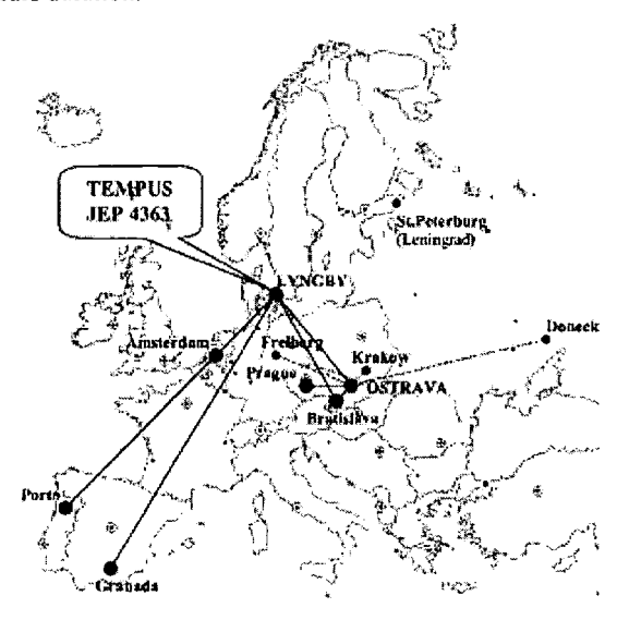
Fig. 2 Co-operative network of the VSB –Technical University in the field of Hydrogeological and

In project contract the objective "to create new curricula in the Environmental Hydrogeology" was accented as a main objective of the JEP. The project was planned for three years duration.