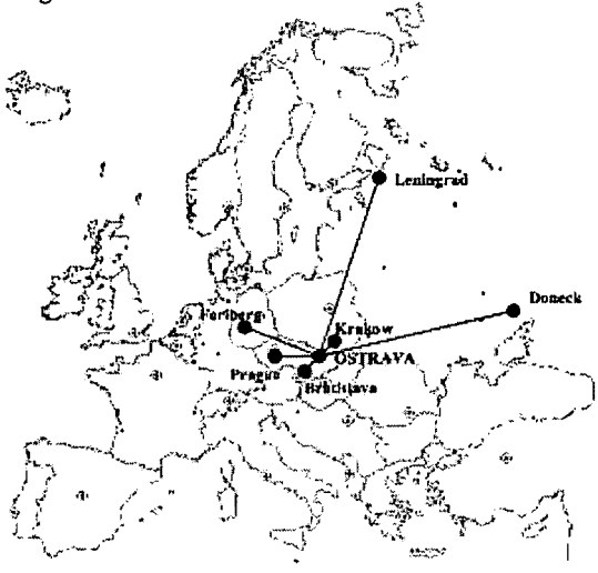
Fig. 1 Co-operative network of the VSB -Technical University in the field of Hydrogeo-logical and Environmental sciences (before year 1989)

awarded a grant from the European Union's overall PHARE budget with the contract N° JEP 8300.