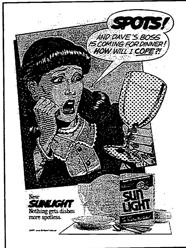
Figure 4. Sunlight Dishwashing Detergent Ad