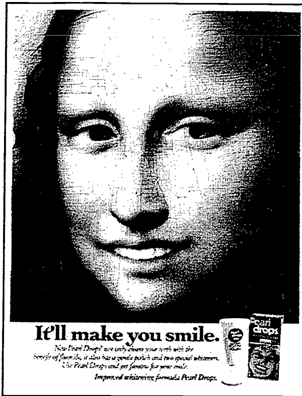
Figure 1. Pearl Drops Ad