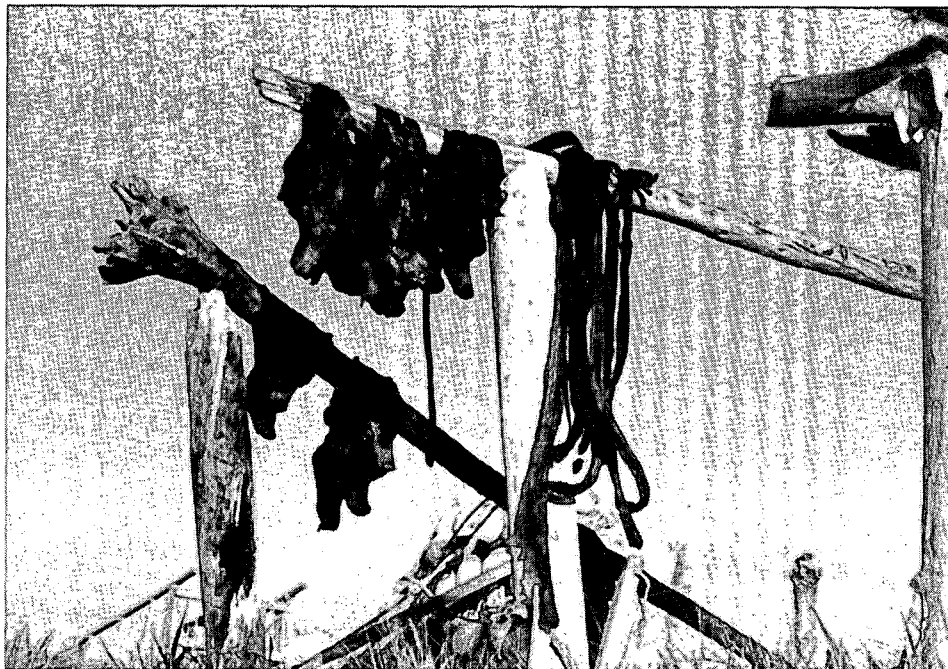
Racks of dried ugruk (seal meat) on the beach of Sarichef Island: subsistence life-style skills such as hunting and preserving food are important parts of Inupiaq education.

couraged them to tell stories about hunting, a way of passing on knowledge that was, in their culture, familiar to them. From these stories, I noted details about which I might later ask more specific questions, but in general, I just jotted down notes as the students recounted their experiences.