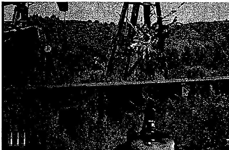
Figure 3. A Single Point Of View: Looking Down Barrel Of A Gun In A Twitch Game

Engagement can be done through how the user sees or controls the screen. Referred to as Point of View (POV), the reference point that one takes can influence how one is engaged. Looking at the screen down the barrel of a gun (see Figure 3) engages you in the world as the participant. You never see the entity being controlled: it is assumed you are the entity and you are controlling yourself.