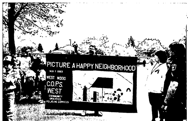
Family Focus Coalition and WSU/Spokane County Cooperative Extension

Key to Spokane's community policing approach is the chief's strong encouragement of actions by officers that go well beyond traditional law enforcement and crime prevention approaches, particular those addressing problems involving Spokane's children and teens. As a result of the motivation