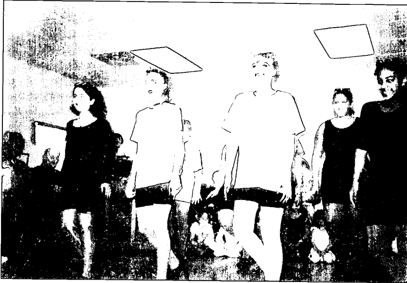
Family Center girls put on a show for seniors.

The primary means of implementing these approaches was through: