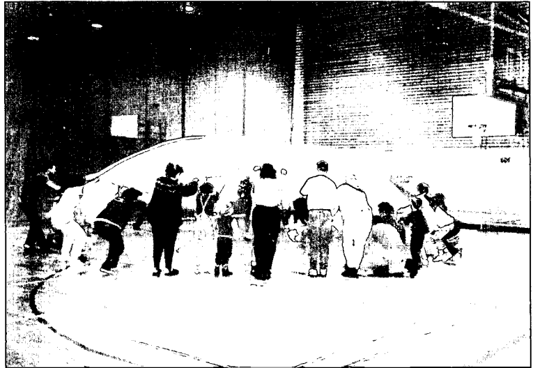
After-school activity at West Central Community Center features team-building game.

In response to this lack, the Girl Scout Council adopted innovative procedures to meet the needs of girls and to introduce neighborhood families to the benefits of Girl Scouting. A professional staff member is organizing and leading troop