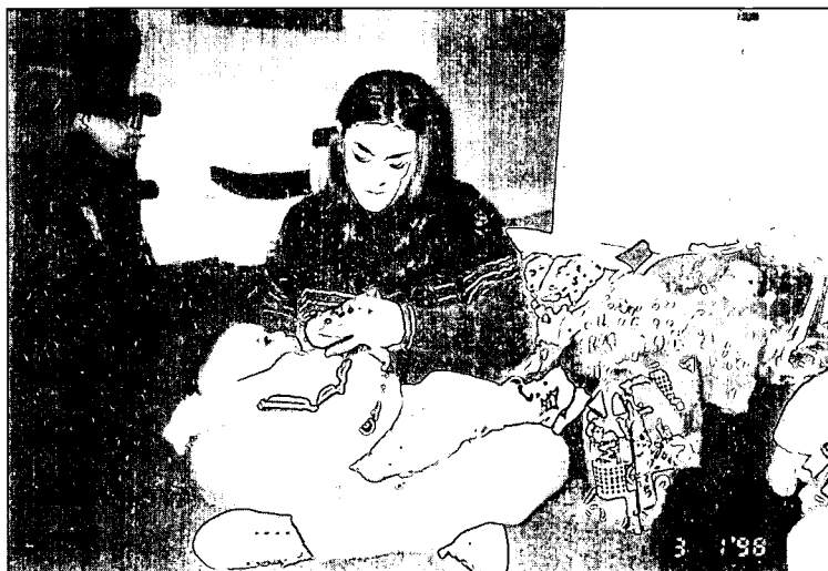
Family Center in Bristol, Connecticut

Frequently, typical adolescent stresses come to the fore—emotional stresses such as the need to establish an independent identity leading to conflicts with their own mothers and fathers; social affairs involving boy friends, best friends, and dating; and academic subjects involving future career choices. To address these concerns, trained Family Center staff provide case management and individual counseling. Close and