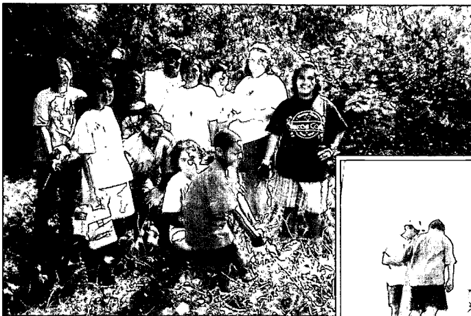
Arlington Teen Center kids do yard work for older residents.

out” is used to discipline a child whose behavior is disruptive. Staff are unambiguously instructed to locate a time out close to the activity in which the infraction occurred. During the time out, the disciplined children are required to sit quietly with their legs crossed and their hands folded in their laps until they are calm enough to rejoin the activity.