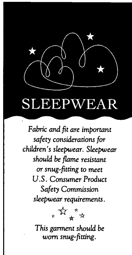
Figure 1: Sample of AAMA Garment Hangtag Design for Snug-Fitting Sleepwear

During our store visits, we specifically examined whether AAMA or other hangtags containing similar wording were used on the garments marketed under each brand choice that we encountered. 7 At each store, we observed the sleepwear displays in departments for infants/toddlers, boys, and girls. We paid particular attention to the presence of hangtags on snug-fitting garments because of the concern that consumers need to understand the importance of proper size selection.