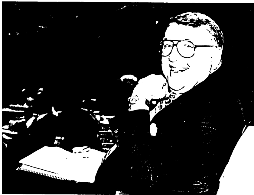
At the Integrated Curriculum Conference II held at the Promega Corporation in Madison on June 22–23, 1995.