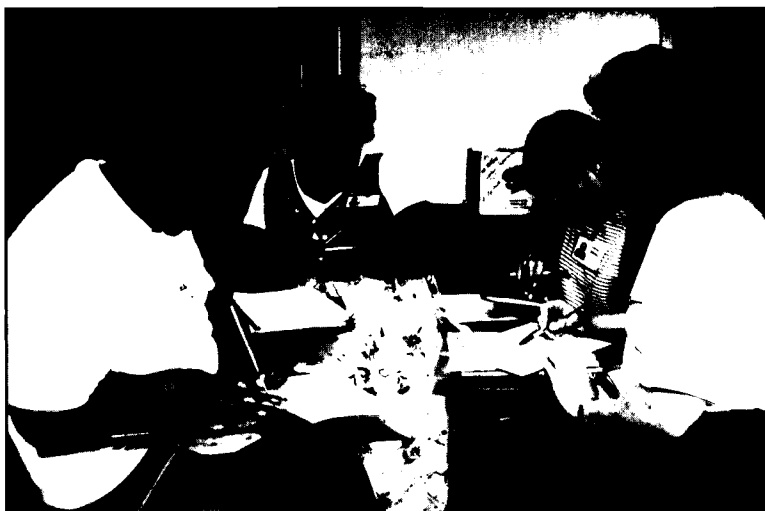
Students in the women's prison work on a math exercise together.