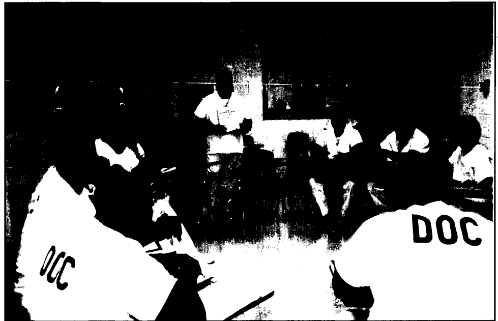
A student shares with the class what he has learned from an MRT step.

The MRT steps helped me the most in Life Skills, beginning with the first step of honesty. That step is as clear in my mind today as if I just read it. I always felt, stealing, lying—politicians and preachers do it, so why not me? But I learned to do the right thing. Now I work for an em-