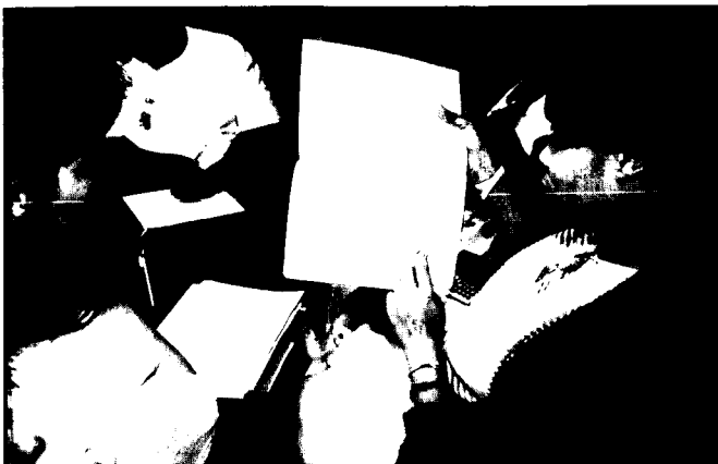
Students review the instructions for completing an MRT exercise.

In addition, the numbers in all four institutions are small because as of 1996 few inmates had been released into the community for at least 1 year. As a result, even when cycle one students from all three institutions and control group members are combined, the recidivism difference is not statistically significant.