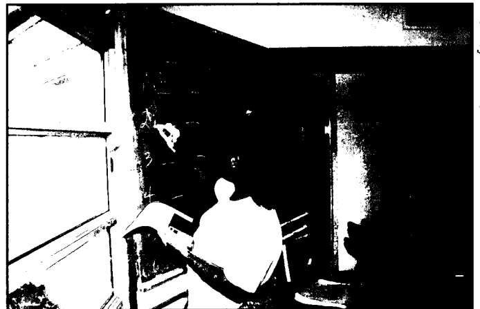
An inmate in the women's prison writes her answers to a math exercise on the chalkboard for other students to check.

Teaching two 3-hour classes 5 days a week for 4 straight months and often dealing with emotionally charged issues can be exhausting and stressful. As one teacher said, "Sometimes I'm so drained from doing MRT in my morning class that I just don't do it in my afternoon class." Despite these challenges, on their evaluation forms students routinely rate the teachers very highly—from 3.57 to 3.77 on a 4-point scale. Students also comment spontaneously about how energized and caring the instructors are: