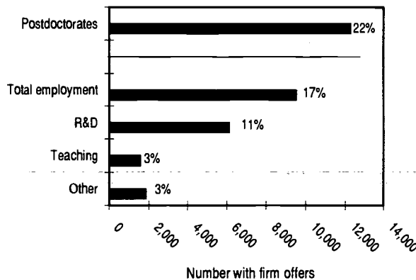
Figure 2. Number and percent of all foreign S&E doctoral recipients with firm offers to remain in U.S., by primary work activity: 1988-96