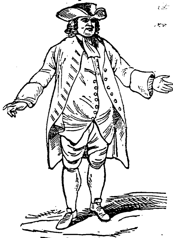
Portrait of Penn.