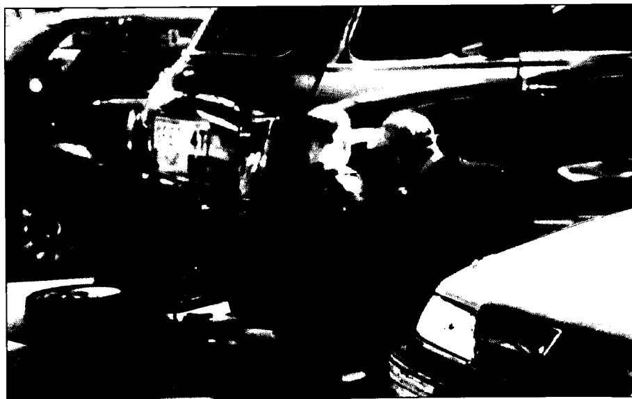
Highbury College helps Royal Marines achieve qualifications for their mechanic skills

Despite this, we are hoping that by keeping additional systems to a minimum, the paperwork and continual assessments will become part of the training ethos within the workshops, rather than being seen as a bolt-on. NVQ qualifications will become a normal part of what each member of staff strives towards and part of the preparation for a future career in the motor industry.