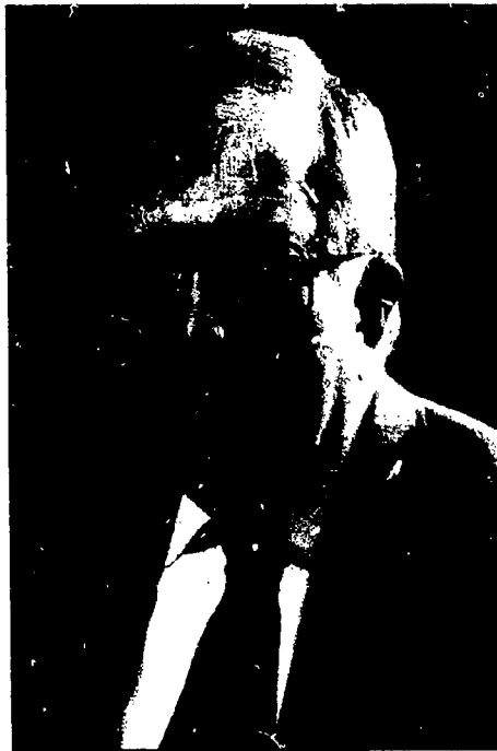
Albert Shanker, President of the American Federation of Teachers, AFL-CIO, 1974-1997.