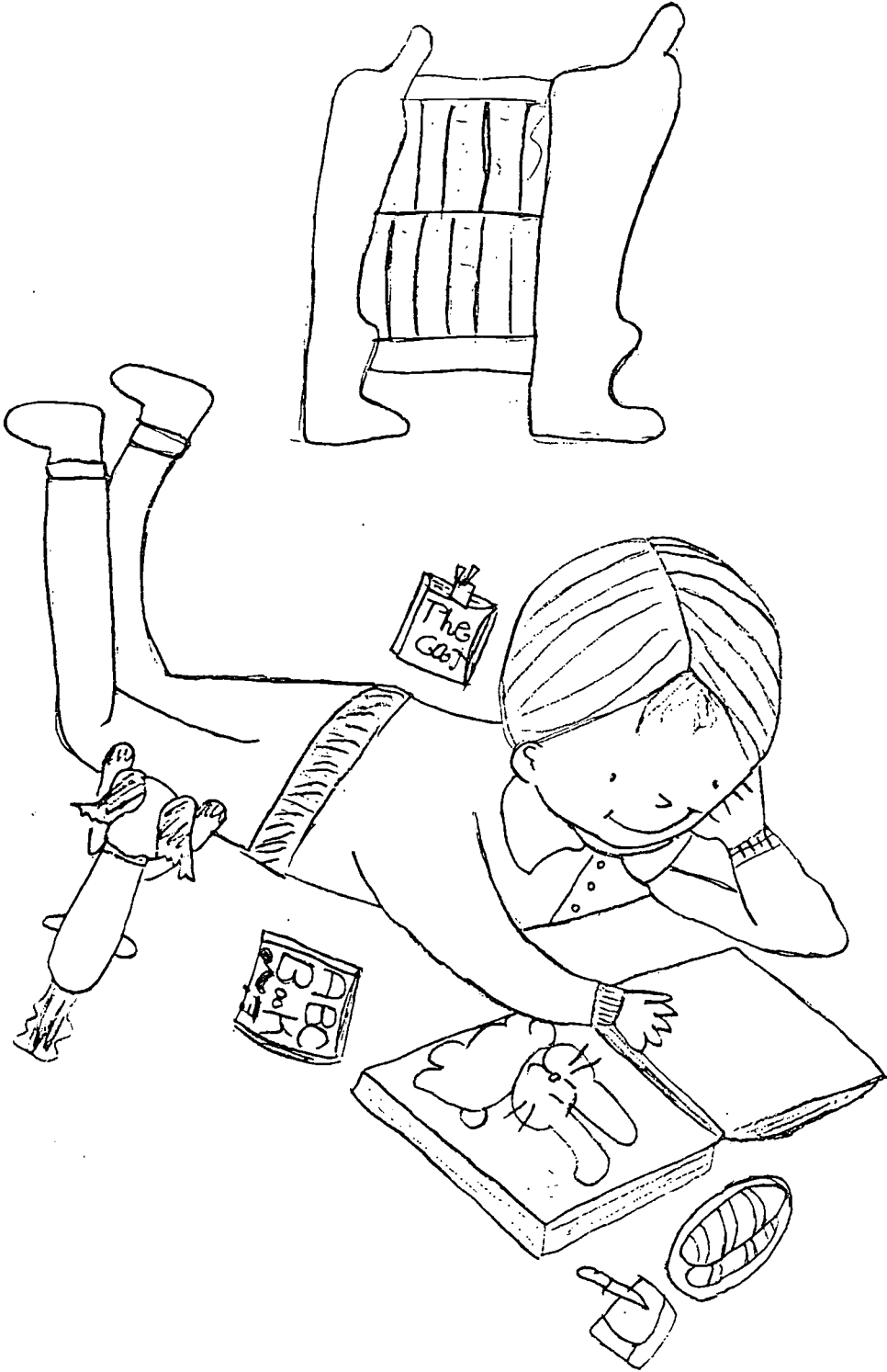
Illustrations by Tami Smith