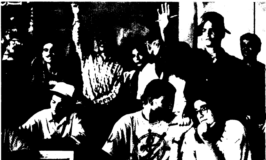
Communities need to be involved in solving their own problems.

Interventions that empower and increase the long-term self-sufficiency of communities, families and children are the most effective. The question is, how can this be accomplished? In refugee camps and settlement areas it is important to engage men and women in the management and administration of the area. Community members can also be involved in the organization of tasks in the camp, including setting up child care centres or providing child care themselves. Micro-enterprise projects can be developed. In addition, it is important to identify traditional coping strategies and strengthen these, and to re-institute traditional rituals, celebrations and ceremonies. (For an example of how this can be done, see the Case Study on Angola on page 33.)