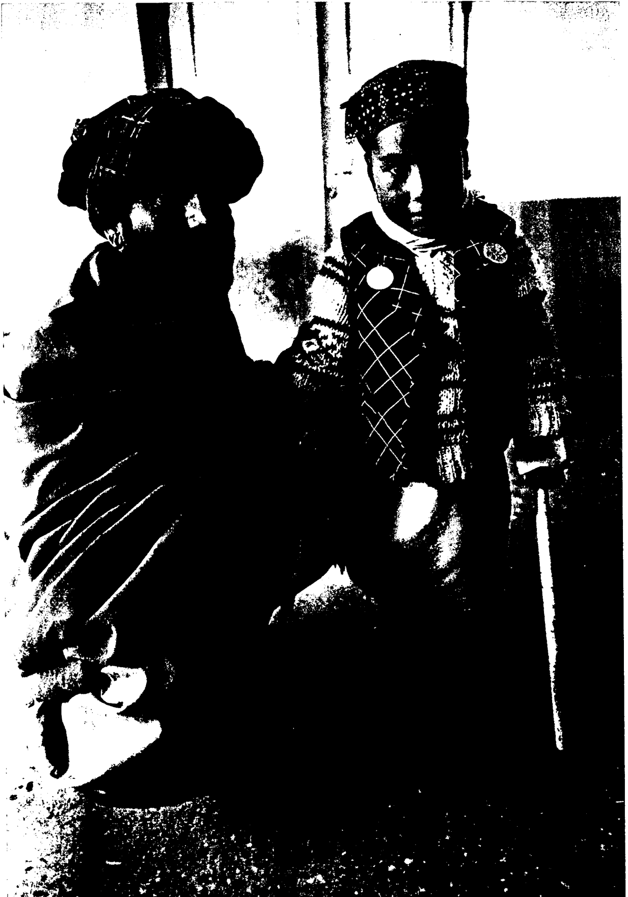
Children are often the accidental victims of war.