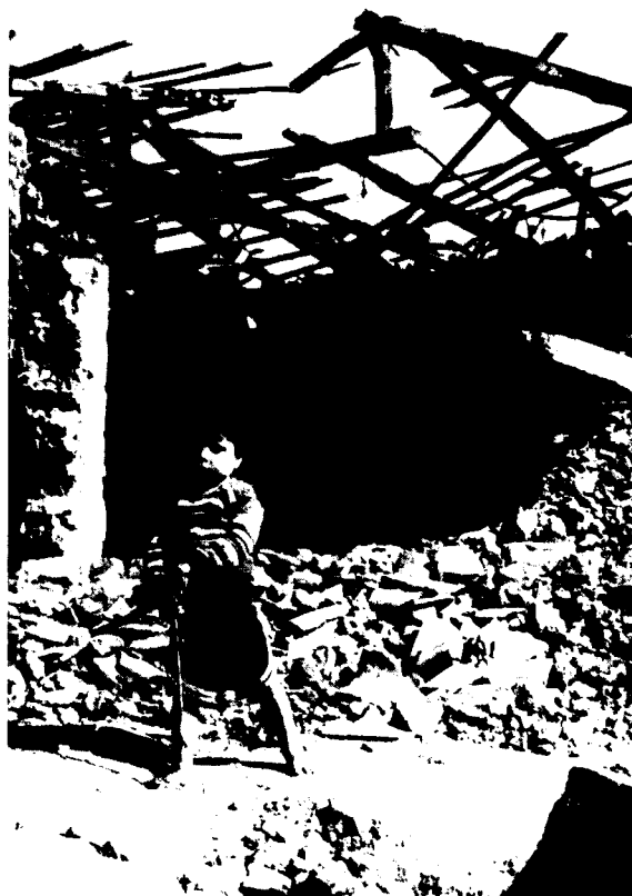
A young child left homeless following a bomb attack on his home.

This is UNICEF's standard reference work on the impact of war on children. A conceptual framework for assessing children's needs in times of conflict is followed by practical examples and technical information to assist in designing programmes. The role of international law in defending the rights of children is discussed, and the concept of "children as a zone of peace" advocated as a means of practical intervention. A wide-ranging bibliography adds to the usefulness of the book.