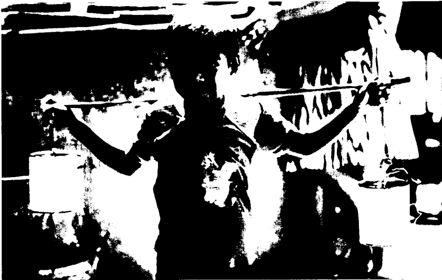
UN PHOTO 155476/John Isaac