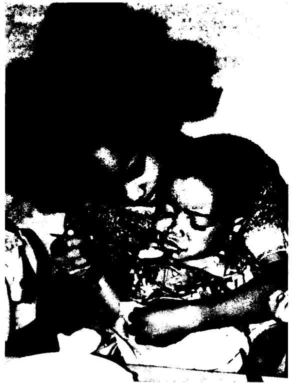
Sometimes older siblings are the only available family.

It is denying children their basic rights if an emergency situation is allowed to prevent them from continuing their normal growth and development. Attention to physical and survival issues is dominant among most organizations, but exclusive attention to these concerns is not sufficient. Children also need to be healthy and loved and supported so that their minds develop as well as their bodies. While life-saving strategies are an immediate concern, interventions should also be designed to support the quality of a child's life.