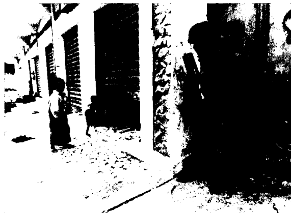
Many violent situations are chronic events in the life of a child.

The victims of war were the children who remained in the village immediately after the village was attacked. Subsequently they showed little sign of aggression and expressed few wishes for revenge. They did not identify with the aggressor, but rather, saw themselves as working toward peace. In terms of their affect these children were characterized as evidencing an overwhelming sadness. They also suffered anxiety, depression and grief. Many of them expressed an emptiness and stated that nothing mattered anymore. Nonetheless, as a group they were able to profit from psychological help. They were able to express their horrors of war and also were able to work through