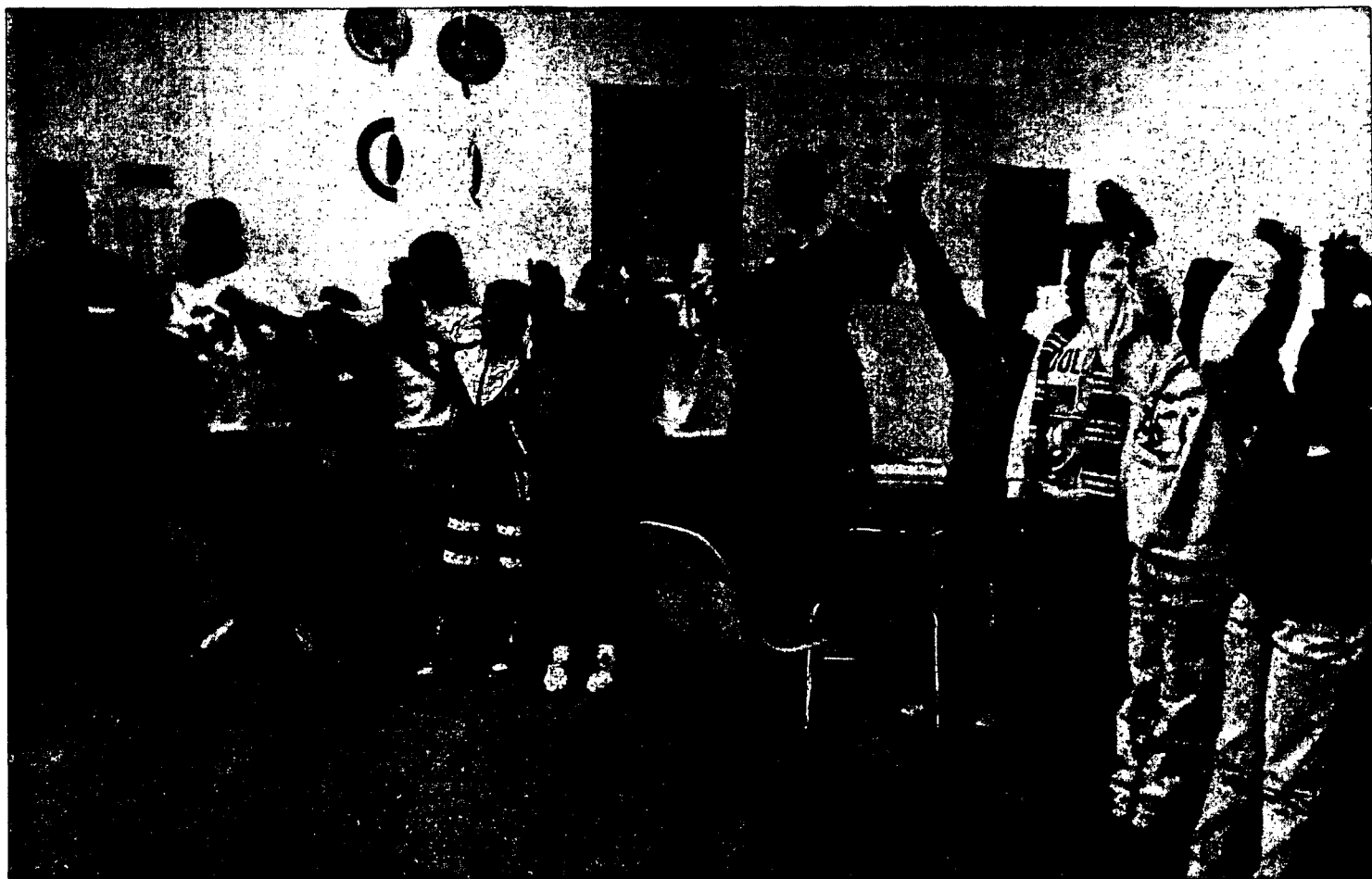
The Afrocentric Educational Academy operates in the afternoon only and seeks to develop instructional strategies that can eventually be used in classrooms all across the district.

looking at people who are skilled but they don't necessarily have to have paper to verify their skill. They don't have to be university types; they can come from the community; they can be skilled and experienced from their life experience too."