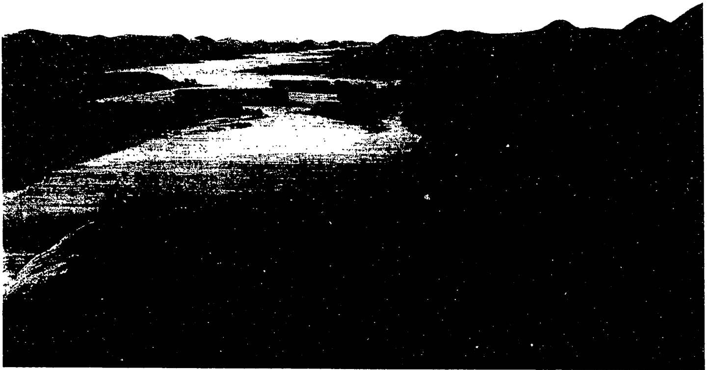
George Catlin, River Bluffs , 1,320 Miles above St. Louis

In the artist's words: "I took my easel and canvas and brushes to the top of the bluff, and painted two views from the same spot. These hills [were] five or six hundred feet high and every foot of them, as far as they can be discovered in distance, covered with a vivid green turf. From this enchanting spot there was nothing to arrest the eye from ranging over [the Missouri's] waters for the distance of twenty or thirty miles."