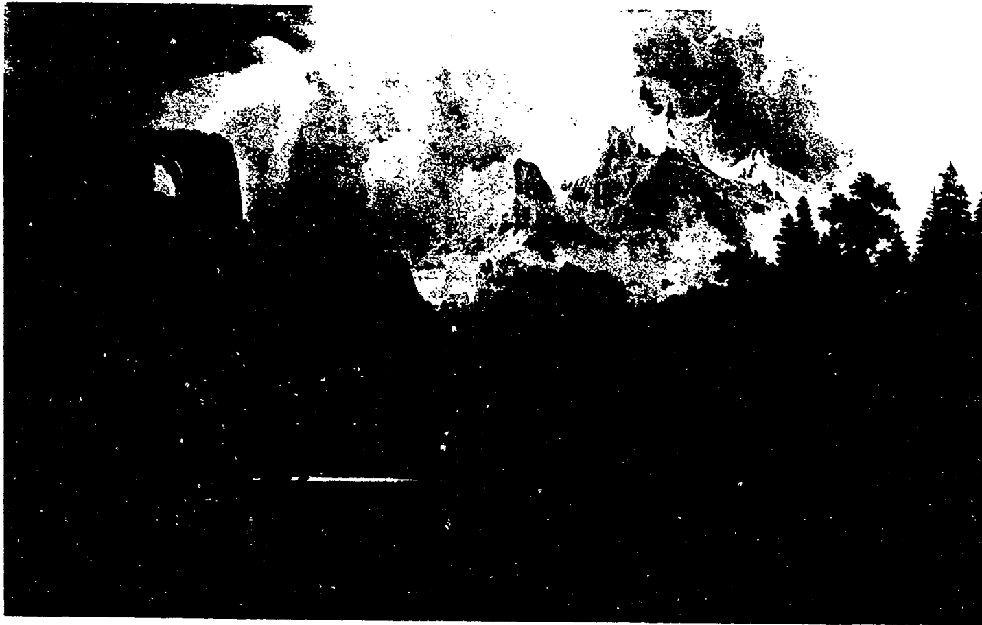
Albert Bierstadt Among the Sierra Nevada Mountains, California