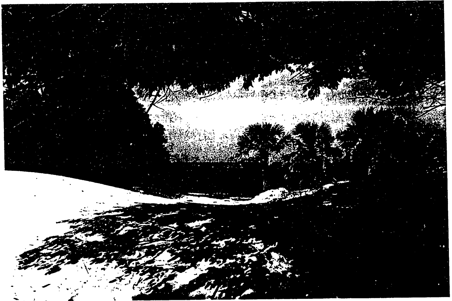
Cumberland Island. Georgia

Instrucciones: Haz un paisaje basado en la fotografía que ves. Como paisajista, puedes usar lápices de colores, marcadores, pinturas, pedacitos de papel de colores o retazos de telas. Trata de usar algunas de las técnicas artísticas que usaron los paisajistas George Catlin, Thomas Moran, Albert Bierstadt, Winslow Homer u otros que te gusten.