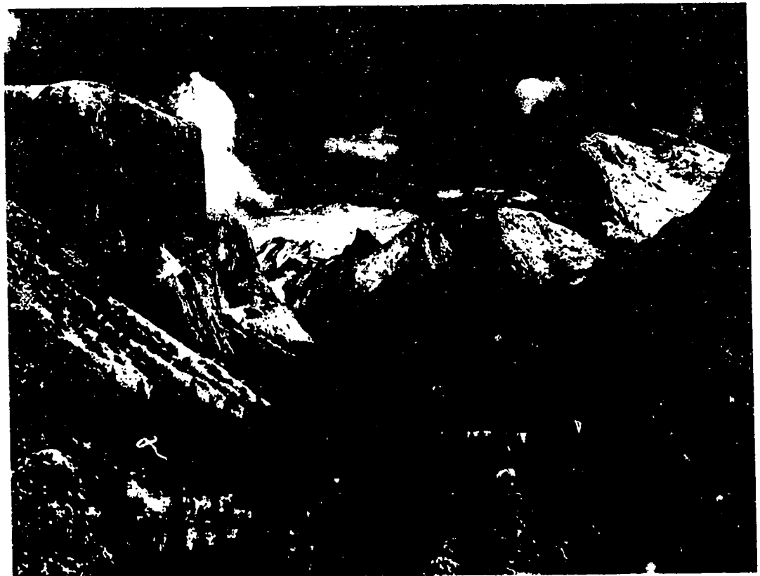
Ansel Adams Yosemite Valley, winter, from Inspiration Point