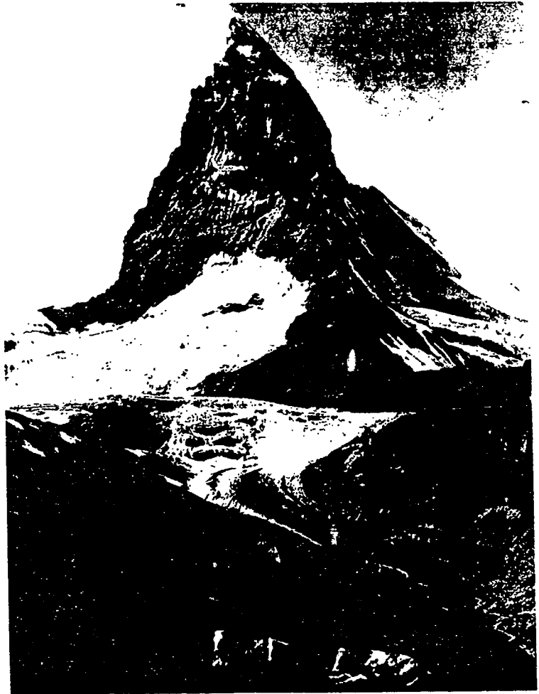
Mount Matterhorn, southern Switzerland