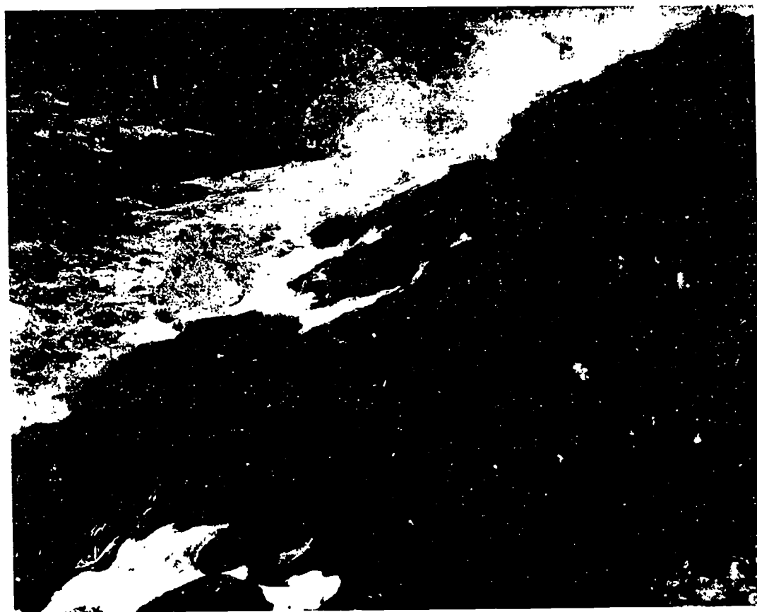
Winslow Homer, High Cliff, Coast of Maine

In the artist's words: "I prefer . . . a picture composed and painted outdoors. This making studies and then taking them home to use them is only half right. You get composition but you lose freshness."