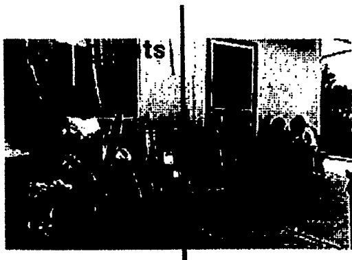
Figure 2. The two activities of packing mats and doing homework become separate.

With this new spatial configuration in place, the two activities that earlier coexisted in one location, sharing one tool (the box), are now divided. This is a very traditional solution whereby the adults are free to continue with their work (in this case, folding mats and placing them in boxes) while the older children in the household take care of the younger ones. The syncretism is this time realized through the blending of a western task (English homework) with a form of social organization that is part of the traditional Samoan learning environment (hierarchical division of labor in caregiving).