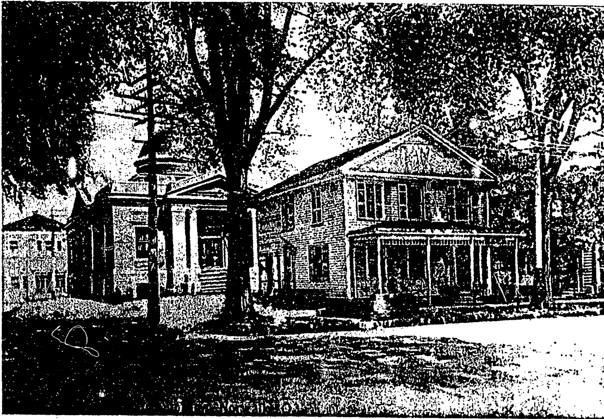
Dwelling Used as Library—1899-1903