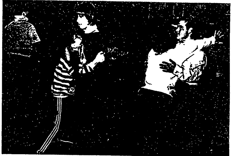
Amy dancing with the guy she used to call her boyfriend

then I realized that I had something moving to take pictures of too."