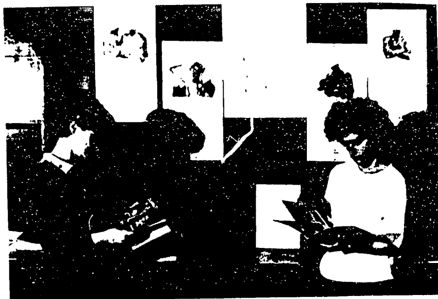
Bulgarian ASP students reflect on human rights issues.