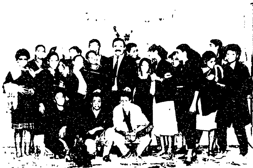
ASP students in Tunisia learn about the work of the United Nations

3. National authorities who encourage international co-operative projects should take steps to ensure that resources are available to permit their own ASP network to fulfill the responsibilities undertaken in the joint enterprise.