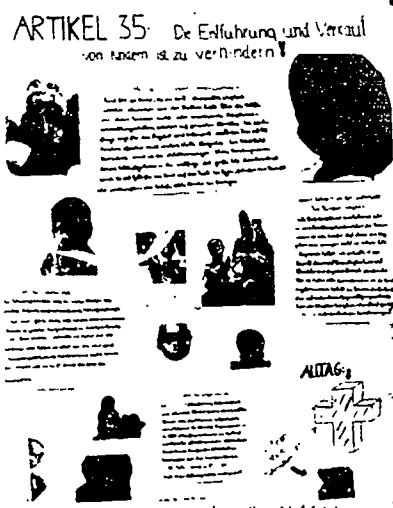
4 German students exhibition concerning the rights of the child

5. Wherever possible, mechanisms should be set up to ensure that materials receive broader dissemination within the ASP and to provide recognition of the efforts made by authors in preparing them.