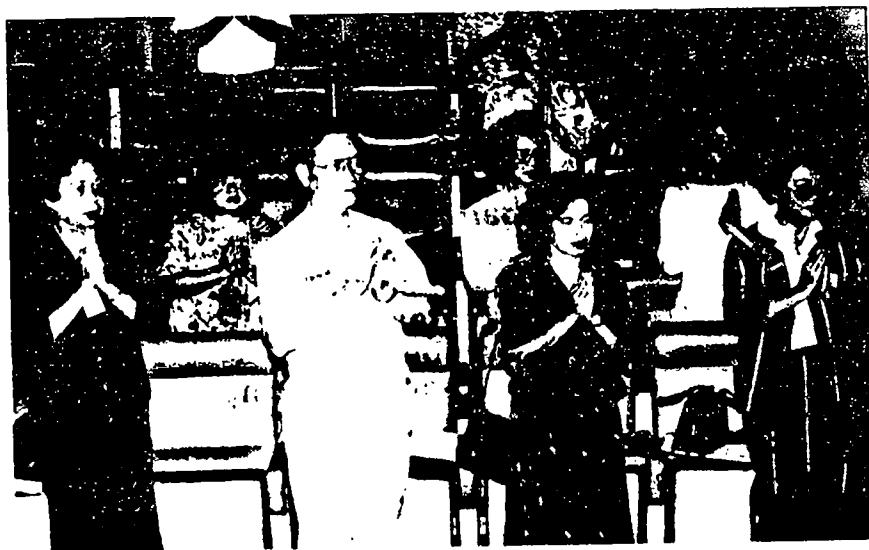
Inauguration of Thai National Seminar to prepare a Teacher's Handbook on Environmental Conservation