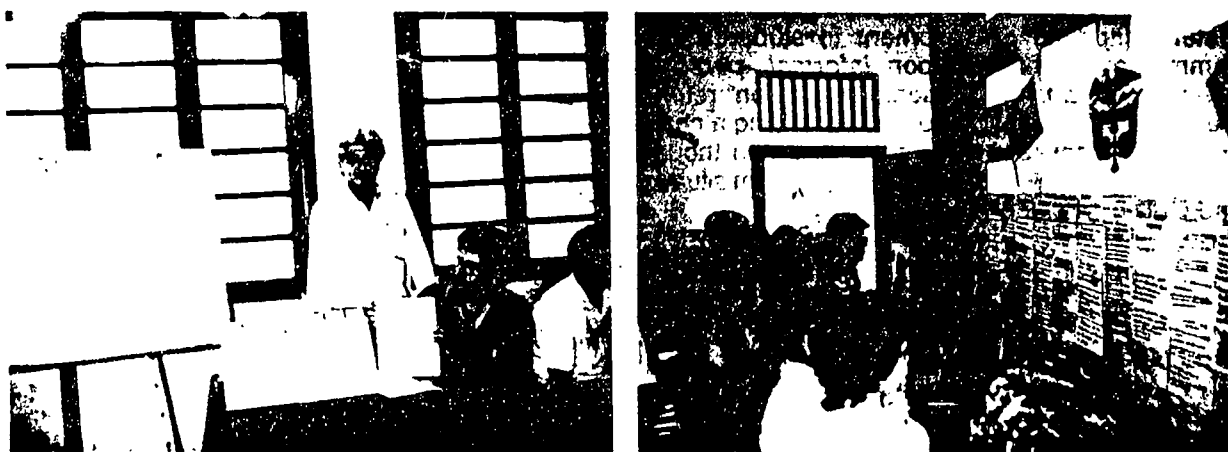
Colombian ASP teachers take part in a workshop on human values education using the METAPLAN technique.

c. Encouraging teacher training institutions to affiliate with the ASP as a means of promoting experimentation with better training methodologies.