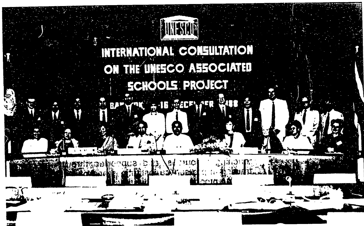
First IRP Consultation at the UNESCO Principal Regional Office for Asia and the Pacific, Bangkok, 1988

The manual concentrates on measures that will increase the use of results from the ASP schools. For information on setting up and running the project, readers may consult: Partners in Promoting Education for International Understanding: Practical Manual for Participation in the UNESCO Associated Schools Project , available from the UNESCO Secretariat.