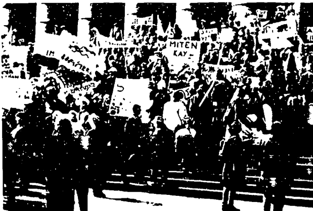
Finnish students meet on the steps of the Parliament to draw attention to issues facing the Baltic Sea

4. Curriculum changes to promote international education should be accompanied by strong measures to renew and improve pre-service teacher training and in-service professional development of teachers. National authorities should take steps, in particular, to make international education a required element in teacher training leading to certification. Encouragement should be given to teacher training institutions to join the ASP and to make use of its facilities as a means of improving teacher training methodologies in international education. Linkages between teacher training institutions and ASP schools at primary and secondary levels should be created to permit teacher trainees to acquire practical experience in innovative classroom activities.