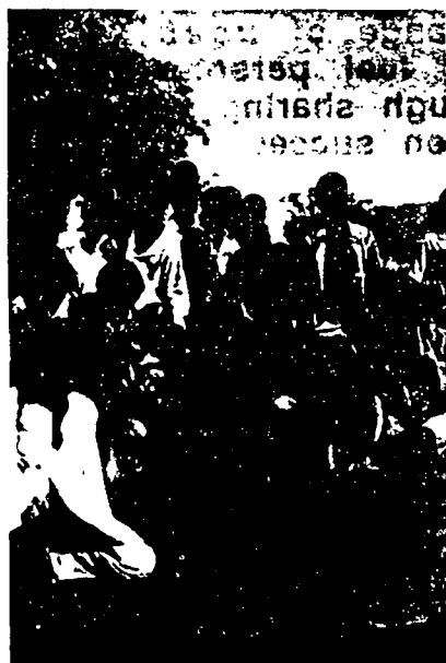
ASP students in Chad struggle against deforestation

In participating countries, the use of extra-curricular and UNESCO club activities has often provided the vehicle for permitting teaching within a highly structured curriculum to be projected outwards into the community, where a far broader range of student activities is possible. In the extra-curricular setting, teachers can set a variety of goals that complement the regular curriculum and may use the stimulus of contact with the surrounding community to motivate students for in-school learning. At the same time, extracurricular activities often are designed in such a way as to provide direct benefits for the community. In many countries, Associated Schools provide through their students a stimulus to local development projects. Tree-planting and similar projects to improve the school and community environment play a large role in countries as diverse as Chad and Colombia.