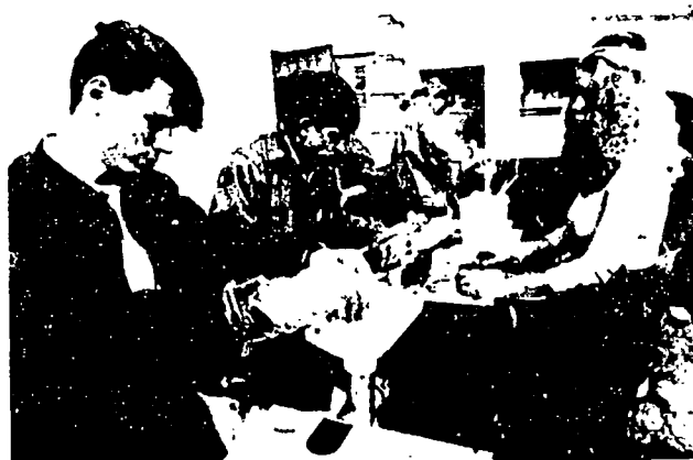
Students from Baltic Sea countries examine fish for possible radioactivity