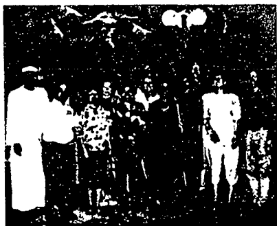
Participants attending Second IRP Consultation in N'djamena, Chad.

This manual grew out of the IRP, but it should be viewed as the by-product of four decades of development. Its purpose is to make accessible the major lessons learned about how national authorities, individual institutions and individual educators can work - each in his or her own way - to increase the impact of ASP schools and spread it to other parts of the educational system. Perhaps the greatest lesson to be learned from this experience is that success depends upon sustained long-term effort at different levels of responsibility.