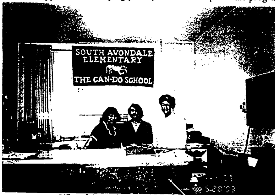
Office of the South Avondale Elementary School

and talented -- every one! This can-do spirit has certainly benefited our work and made all the difference in implementing the Consult Reading program. Only through such genuine support can real change be effected.