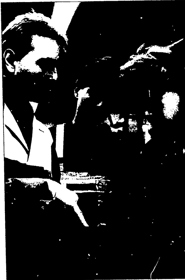
70% of a young persons' year group choose dual vocational training in Germany.

Young persons who have completed school also need new prospects. Practical vocational training without a