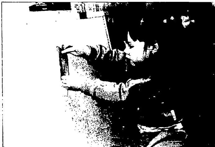
Young children may be able to represent what they are thinking with felt board pieces

representation (pictorially). However, they may be able to represent their thinking with felt board pieces. This makes it easier for the early childhood practitioner to observe what very young children understand. It must be remembered that this symbolic representation must only be used after children have had sufficient experience with concrete materials.