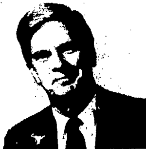
James H. Billington, The Librarian of Congress, Washington, D.C. (Permanent Member)