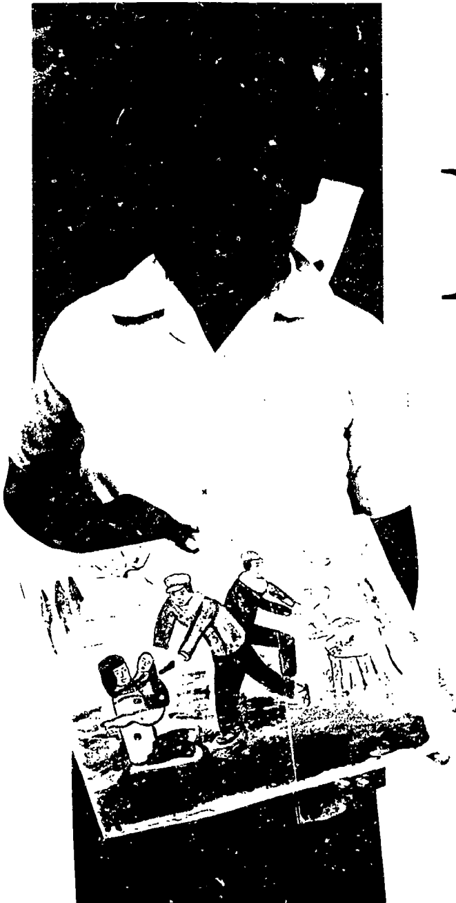
Uprooted children often bear serious psychological scars. Here, a young boy in a camp in Cambodia shows one of his drawings, which reflects something of the youth's traumatic experiences.

THIS FINAL DECADE OF THE MILLENNIUM IS FULL OF TUMULTUOUS CHANGE, MUCH OF IT A CAUSE FOR REJOICING. BUT MANY EVENTS IN THE 1980S AND EARLY 1990S HAVE CAUSED TRAGIC FLIGHTS OF MILLIONS OF REFUGEES: THE BREAKDOWN OF FORMER SOVIET UNION, THE WRENCHING CIVIL CONFLICTS IN EX-YUGOSLAVIA, LIBERIA, MOZAMBIQUE, SUDAN, SOMALIA AND SRI LANKA, AND THE GULF WAR, TO NAME BUT A FEW.