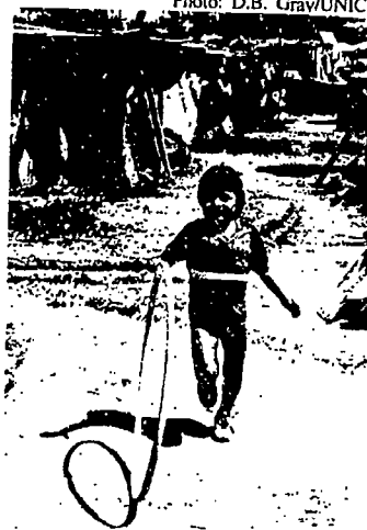
In the drab environment of refugee camps, play becomes all the more important.

rated into the system of the host country, learn a new language and prepare for a future in exile?