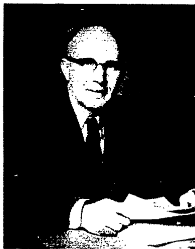
Augustus F. Hawkins Former Congressman and Chairman of Education and Labor Committee

"The success being achieved in some schools and districts should provide models and encouragement that using the law in a cooperative, coordinated, and comprehensive way can produce desired results even with long odds."