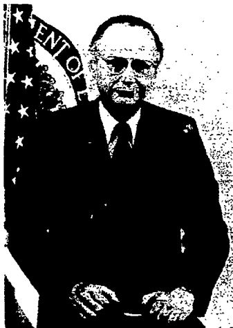
Richard W. Riley Secretary of Education

"It will offer teachers greater opportunities for professional development and prepare them to teach enriched curricula."