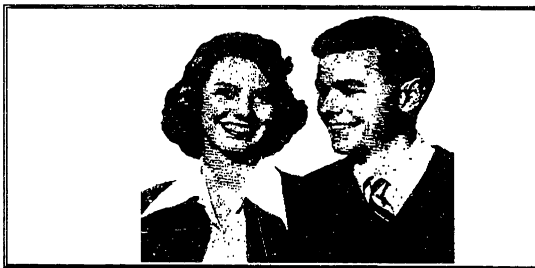
Figure 1. Opening illustration for Unit 7 in 1956 edition of Modern Biology (p. 450).

The topic of human biology covers two units. Unit 7 is "a practical study of human biology" entitled "How Biology Applies to Ourselves" (p. v); Unit 8, an examination of "Biology and the Problems of Disease." The focus of both units is on the student and his health. The introduction to Unit 7 makes this emphasis clear. At the top of the page, two students--a boy and girl--smile. (See Figure 1.)