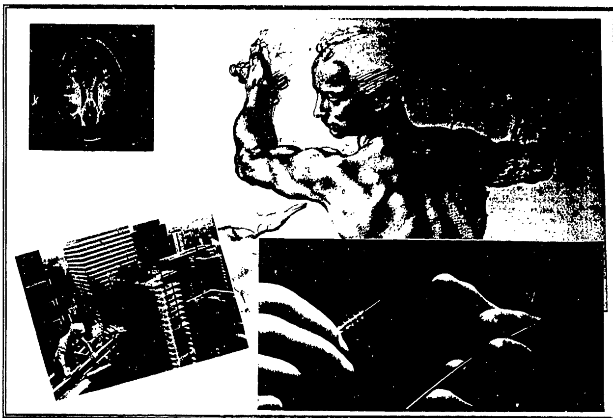
Figure 3. Opening illustration of anatomical drawing by Michelangelo, MIR of human brain, surgeon's hands and construction worker in Unit 9 of 1989 edition (pp. 634 - 35).

As with the textbook, the unit on human biology has expanded in length and scope. It is now 127 pages long and includes a "new" chapter on infectious diseases and the immune system. For the third time, the unit cover pages--this time, there are two--summarize the character and purpose of the chapters to follow. The pictures on these cover pages are shown below. (See Figure 3.)