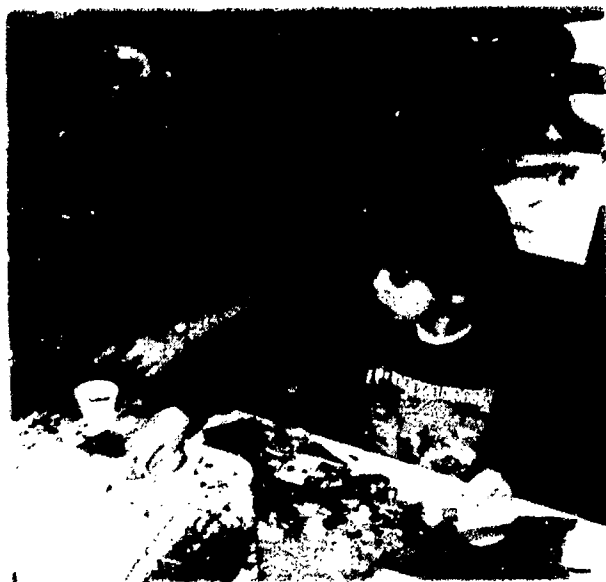
"Parent involvement for the Four-Year-Old's Program approaches 100%."

The instructional format of the PCHP is fixed by the model that it follows. This model, the "Freeport" or "Levenstein" model, was examined in 1979. Pittsfield's component was included in the analysis. There is a very close, ongoing relationship