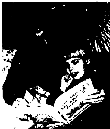
"Parent involvement in Pittsfield's Chapter 1 program is both a philosophical premise and the hallmark of its success."

The PCHP replicates the Verbal Interaction Project model of the home-based instruction for parent-