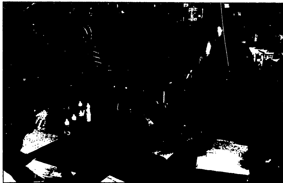
The NSTA's SS&C program is now being pilot-tested in several hundred schools. These 7th graders in the Houston, Texas, site are using tests to identify basic food groups.

A four-week unit suggested by the NSTA is one example of how content from the science disciplines could be integrated. Students examine a series of questions: What is density? How do I measure the density of a solid or liquid? Why do some things float and others sink? Through a series of activities, pupils study density, marine organisms, oceans, and solutions, thereby integrating concepts from physics, biology, earth science, and chemistry, respectively. Using real materials, such as wooden blocks, they test their hypotheses about density. Then they extend the knowledge by taking on the broader question: How is density useful to humans and