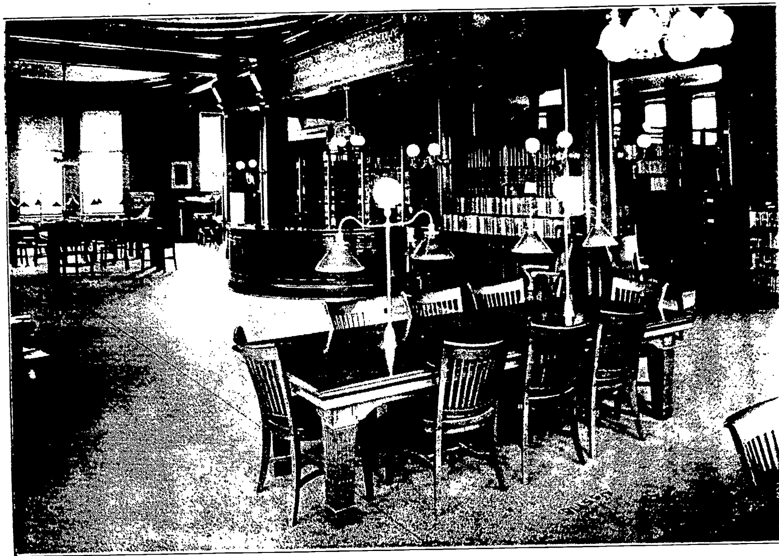
Interior Lincoln Public Library