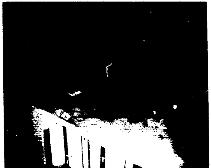
A marijuana pipe found in the supply room in the basement of P.S. 105. Marijuana residue was located on a table in the same room. (Photo taken on 11/14/91)