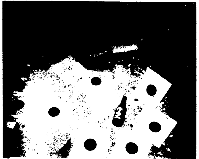
Used targets and an empty beer bottle scattered on the floor of the sub-basement. (Photo taken on 10/28/92)