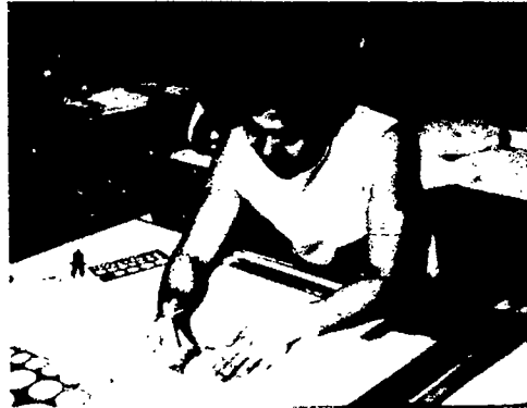
Drafting, boat building/repair, and horticulture are among the many fields of vocational education available to students.