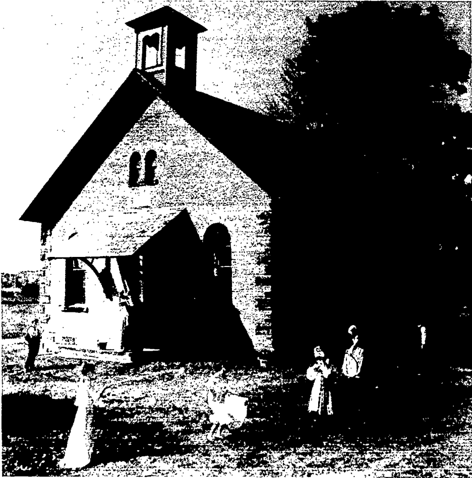
A typical one-room school building

The new county superintendents must have faced the opening of the school year with anticipation and trepidation. First, they were navigating in uncharted waters. Second, they were all hired in July to take office on August 1 and open a new school year in September. In the meantime, they were supposed to form supervision districts, nominate district superintendents, and prepare minimum courses of study for the village and rural districts. Finally, they were being viewed positively as people who could substantially improve education, and negatively as people who threatened the autonomy of the local school system.