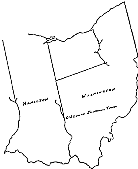
Ohio County Boundary Lines in 1792.

(Reprinted from Evolution of Ohio County Boundaries , p. 14, ©1970, with permission from the Ohio Historical Society.)