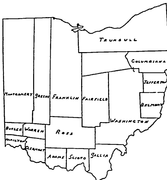
Ohio County Boudary Lines in 1803.