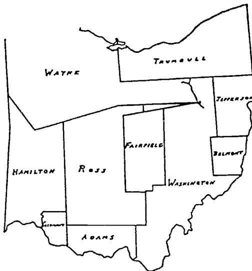
Ohio County Boudary Lines in 1801.

(Reprinted from Evolution of Ohio County Boundaries , p. 22 ©1970, with permission from the Ohio Historical Society.)