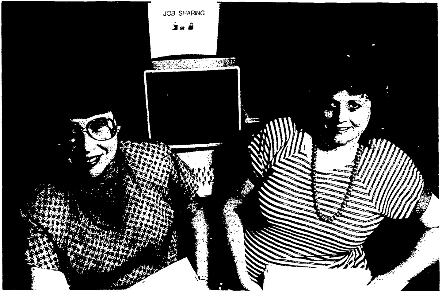
Figure 2.1: Job Sharing Allows Part-Time Workers to Hold Full-Time Jobs