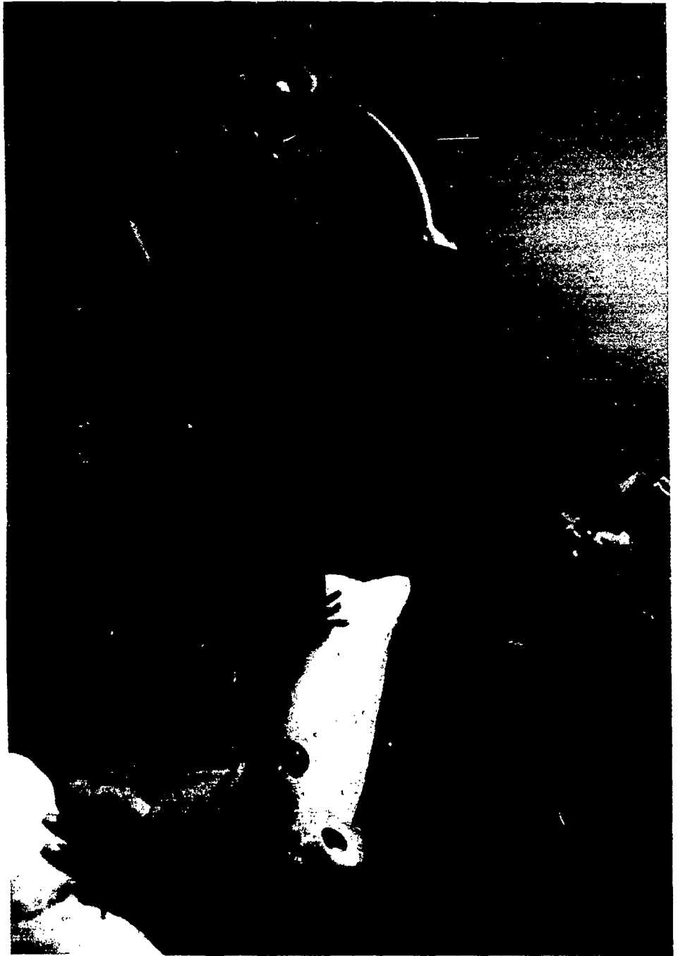
Figure 2.3: Some Employers Allow Use of Sick Leave to Care for a Sick Child