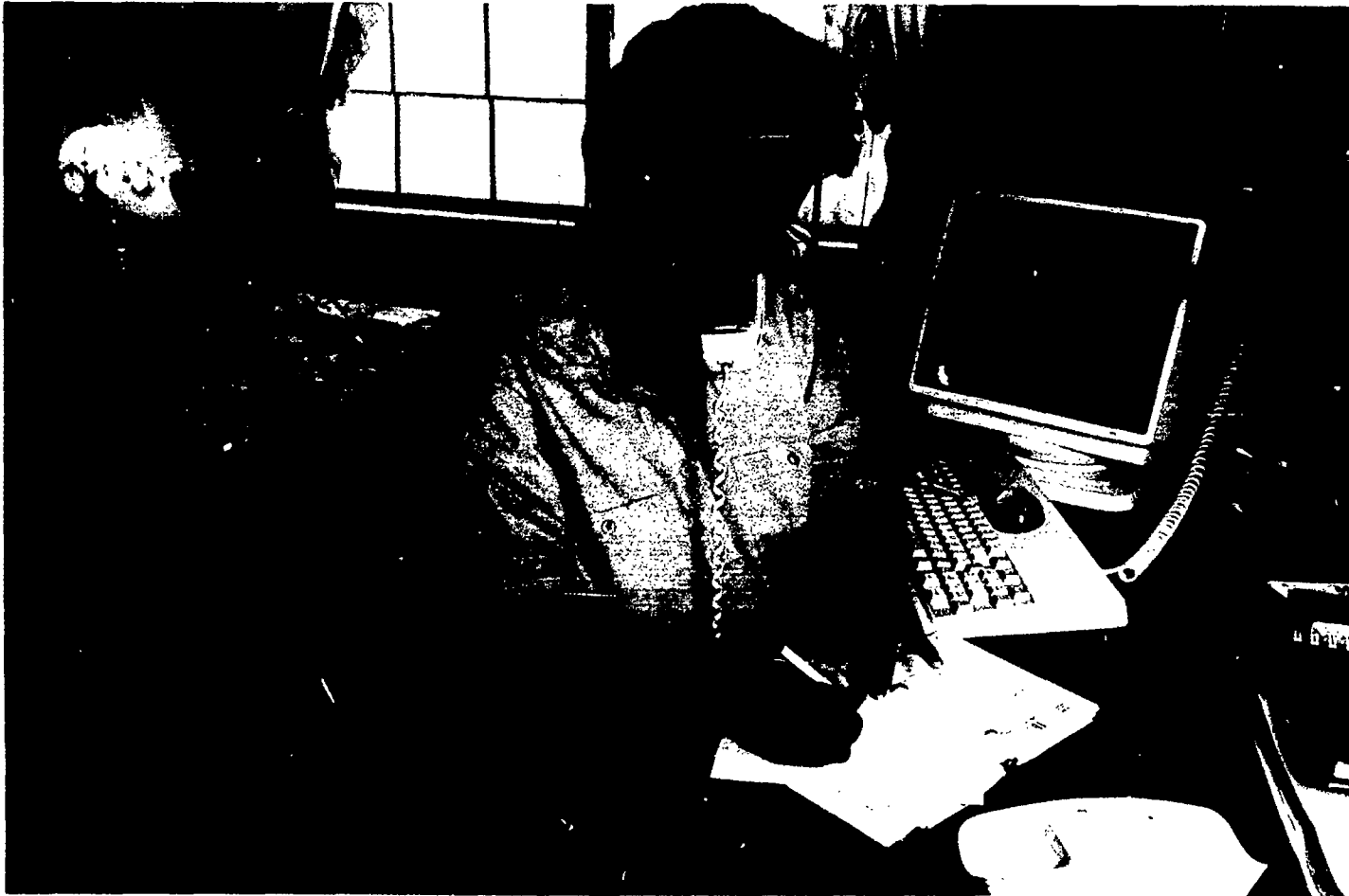
Figure 2.2: Flexible Work Place Arrangements Allow Employees to Work at Home and Telecommute to the Office