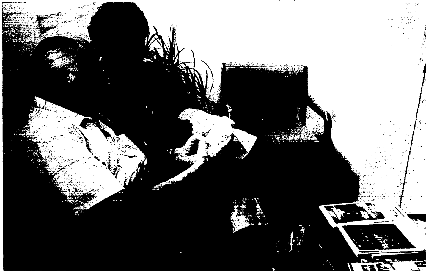
Figure 2.5: Elder Care Programs Help Employees Care for Parents and Other Elderly Dependents