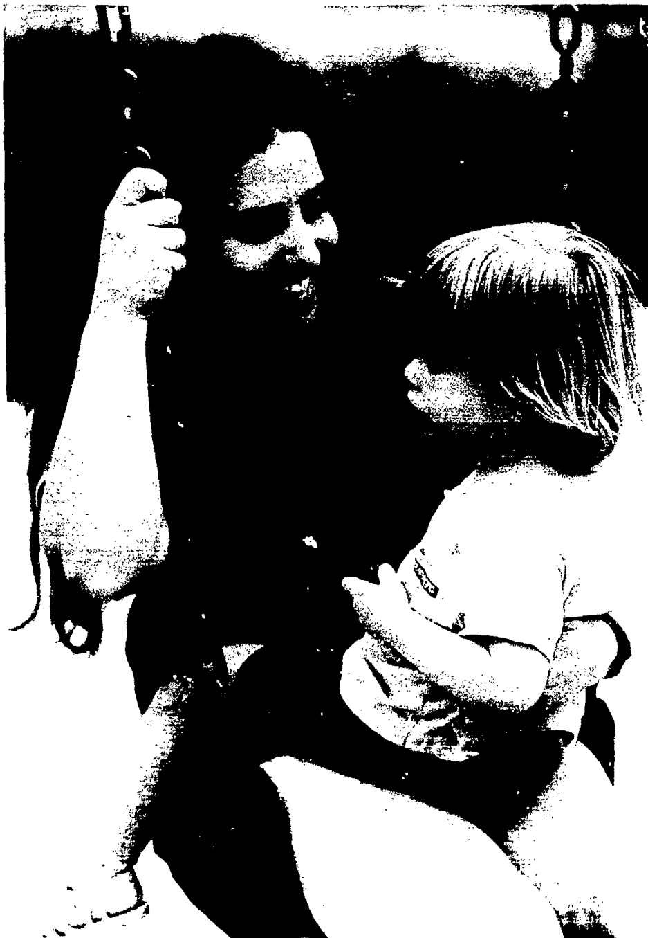
Figure 2.4: Child Care Centers May Be On or Near the Worksite