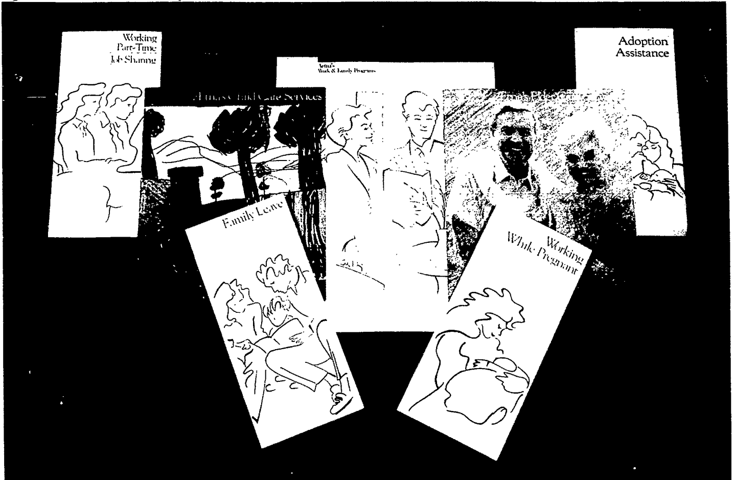
Figure 3.4: Aetna's Work/Family Brochures