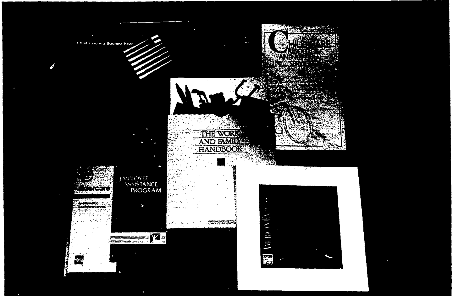
Figure 3.5: American Express' Work/Family Brochures