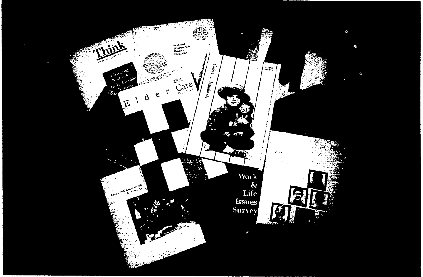
Figure 3.3: IBM's Work/Family Brochures