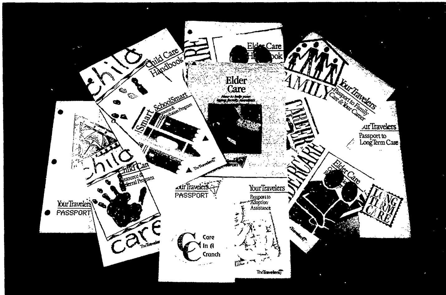
Figure 3.1: Travelers' Work/Family Brochures