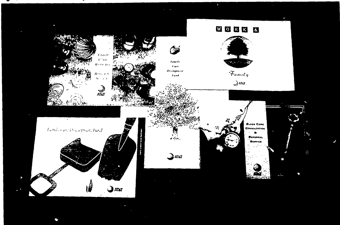
Figure 3.2: AT&T's Work/Family Brochures