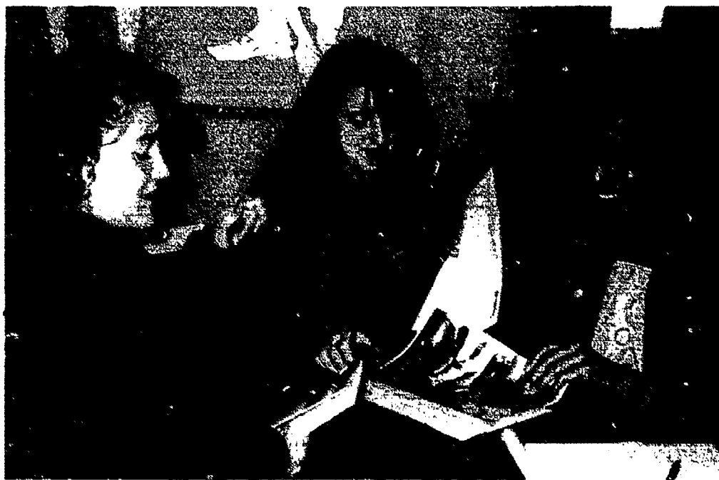
A group discusses the U.S. amendments

In this issue, we visit the classrooms of two social studies teachers in California who trained in CI. In each case we observe an adaptation of the essential elements of the theory; each uses techniques designed to engage stu-