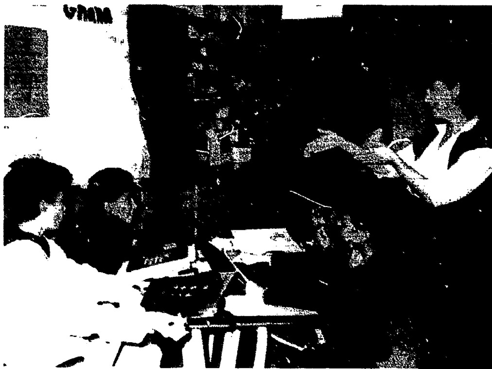
A group visit

In this cluster of mixed socioeconomic status—45 percent on free and reduced lunch—absences are common, today some students must regroup. New group members must examine a culture different from the one they studied the week before.