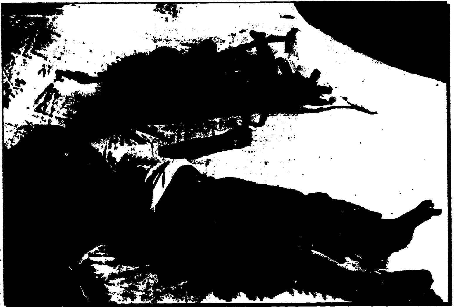
ERIC photo 145 361 by Lily Solmanova

To achieve the goals of "full participation and equality," rehabilitation measures aimed solely at the individual who is disabled are not sufficient. Experience shows that it is largely the environment that determines the effect of an impairment or a disability on a person's daily life. A person is handicapped when he or she is denied the opportunities that are necessary for the fundamental elements of living. These elements include family life, education, employment, housing, financial and personal security, participation in social and political groups, religious activity, access to public facilities, and freedom of movement.