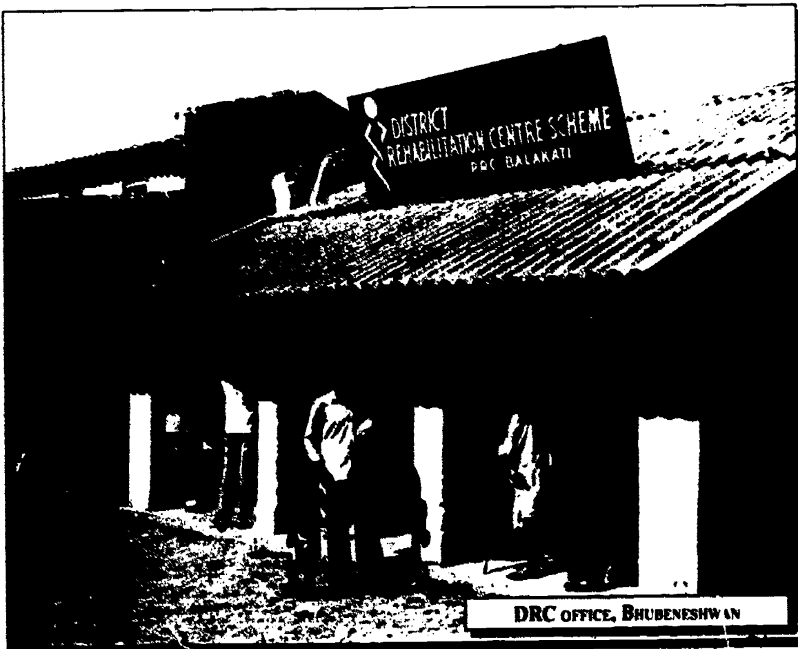
DRC OFFICE, BHUBENESHWAN

Fund of rupees, paid for U.S. grain in the 1970s but held in India at the U.S. Embassy for such cooperative research programs. A proposal is written by the MOW/GOI, and then reviewed by NIDRR. After negotiations and an additional clearance from the Indian Government, the proposal is accepted. All authorizations and adjustments are then made through NIDRR recommendations to the U.S. Embassy which administers the paperwork for the grant. Included in NIDRR responsibilities to the project are on-site monitoring and the provision of consultations and technical assistance from the U.S. rehabilitation and special education community.