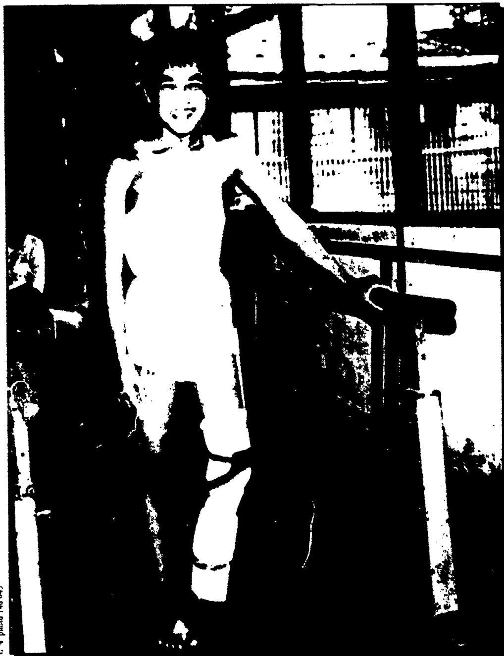
L. N. photo 146 145

related actions of the UN agencies, such as UNICEF, the World Health Organization, the International Labor Organization, the UN High Commissioner for Refugees, and UNESCO.