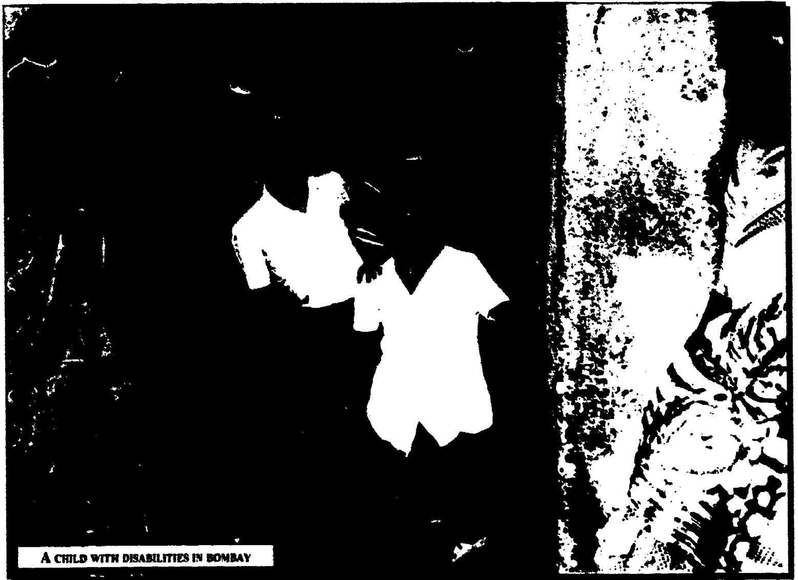
A CHILD WITH DISABILITIES IN BOMBAY