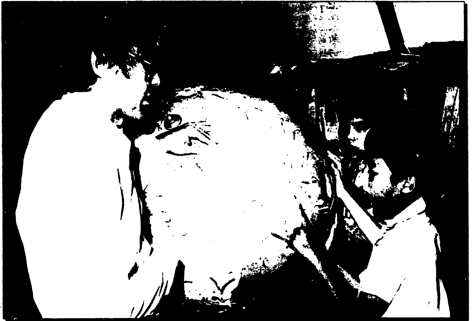
146 B46