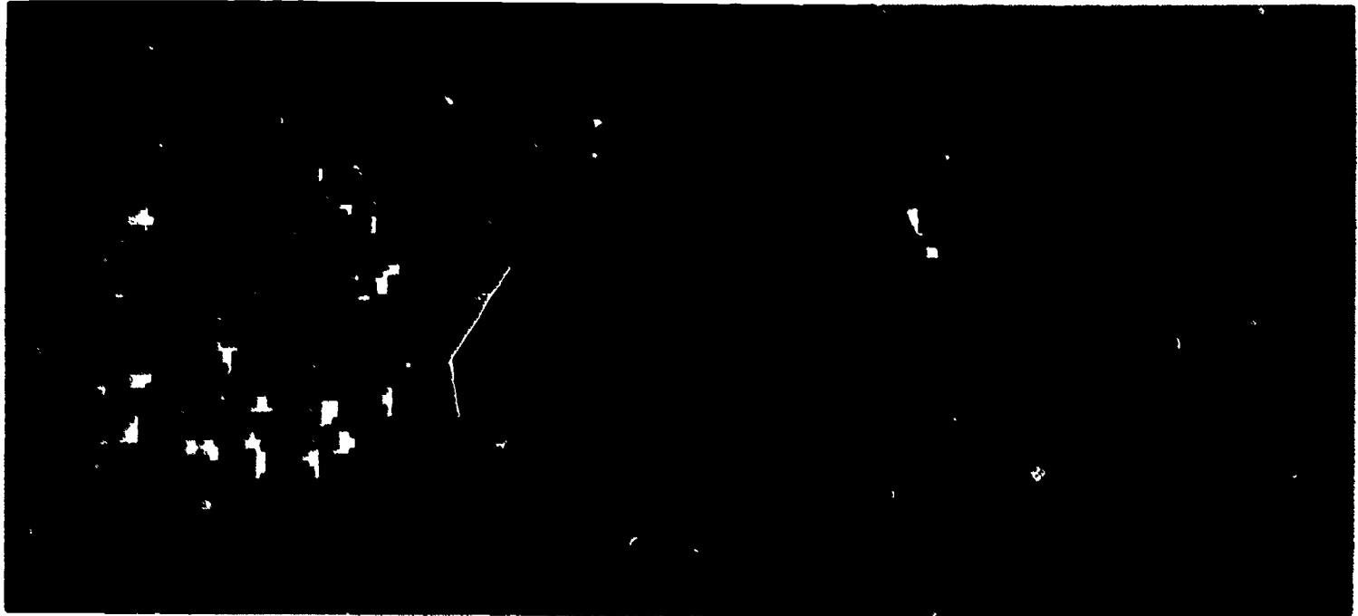
Figure 2. PET scan images: The image on the left is the normal control, while the one on the right is the ADHD adult.

The left side of each image represents the right side of the brain. In the original color images, white, red, and orange indicate areas of relatively high glucose metabolism, whereas blue, green, and purple indicate areas of lower glucose metabolism.